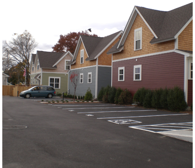
Porous asphalt parking spaces at Cottages on the Greene in East Greenwich.

When correctly installed and maintained permeable pavements have proven to be practical, cost-effective, and environmentally sustainable due to their usefulness in reducing urban stormwater runoff. Permeable pavements are an example of green infrastructure that can replace gray infrastructure. Gray infrastructure includes those hard surfaces that move stormwater away from developed areas such as roofs, gutters, impermeable driveways, and roads as well as storm drains and sewers. The green infrastructure solution to stormwater is infiltration of that water on site where it can recharge groundwater, reducing the flow of pollutants to local water resources.