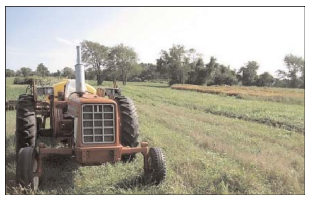
Tractor on the Wicks Nursery property