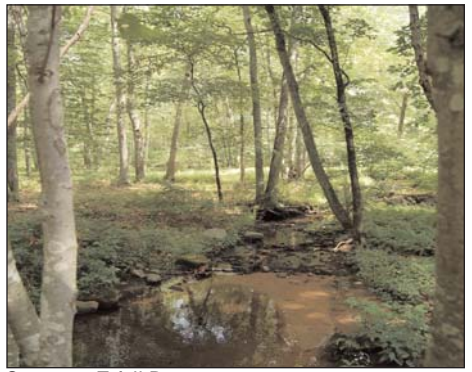
Stream on Teft II Property.