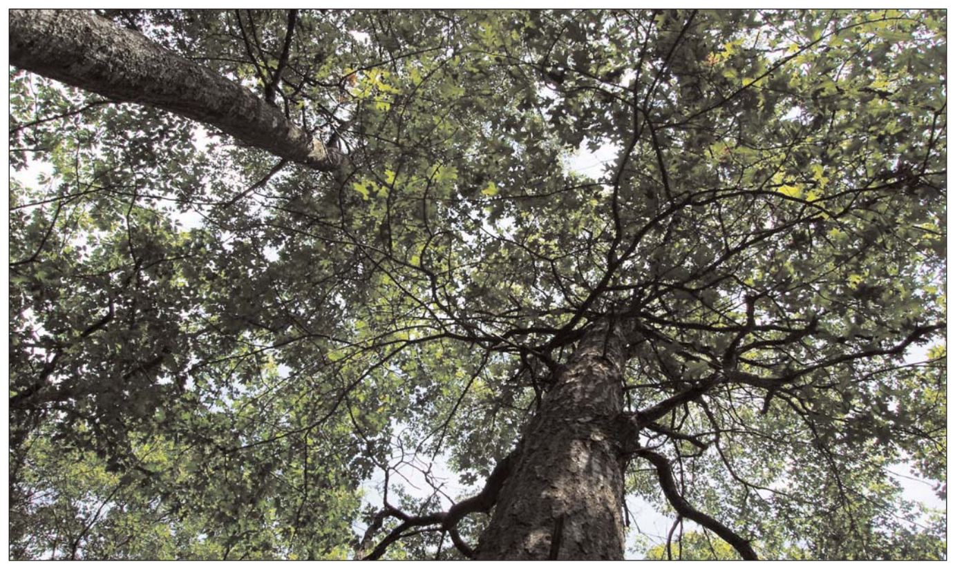
Trees on the Girl Scouts property.

The Land Acquisition Program will need to continue to creatively strategize the leveraging of federal dollars and work with non-profits, municipalities, and local land trusts to take advantage of the favorable market.