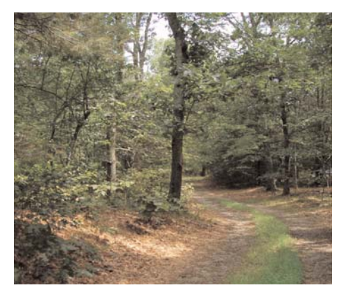
Wooded entry road on Girl Scout property.

The acquisition was funded through a US Fish and Wildlife Service grant of $1,300,000 and by The Nature Conservancy with a contribution of $500,000 through The Champlin Foundations. In addition, The Girl Scouts generously donated $160,000 in land value through a reduction in purchase price.