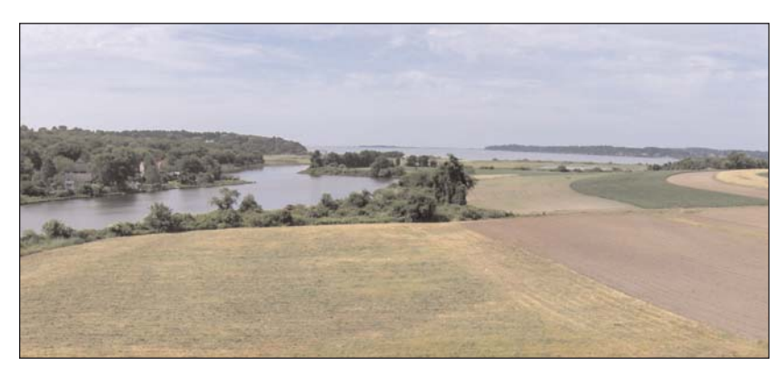
Ferolbink Farm Fields

This farm was protected with a combination of funding from the Agricultural Land Preservation Commission, DEM's Open Space Bond, the NRCS Farm and Ranchland Protection Program, The Nature Conservancy, The Champlin Foundations, the Tiverton Land Trust, and the Little Compton Agricultural Conservancy Trust.