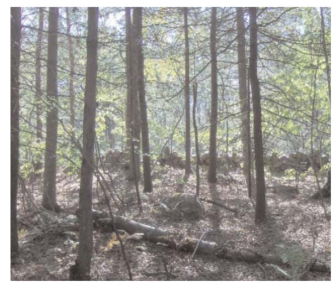
The Grass Property