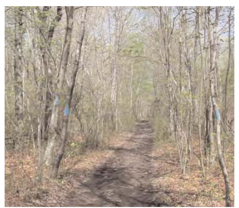
North/South Trail on the Delvecchio Property.

The forested properties contain frontage along the North/South Trail, which is a 77 mile hiking trail that runs the length of Rhode Island. The trail also links to the Massachusetts Mid-state Trail, and the New Hampshire Wapack Trail, for a total 191 miles. It features rural and scenic vistas ranging from beaches, farmland, rock outcrops, and dense woodland. Both properties will be open for immediate public access and use through existing trails, and will eventually link to the Quanduck Brook Natural Greenway in Killingly, CT.