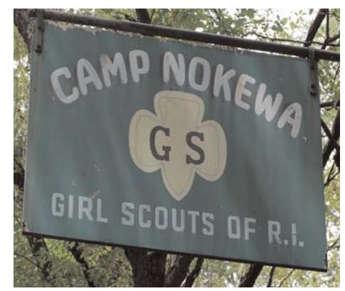
Girl Scouts sign.