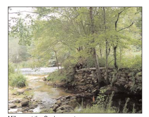
Millrace at the Cook property.

The property, which was funded by the DEM's Open Space Bond, also contributes to a much larger accumulation of land along the river front, protected by organizations such as DEM and the Nature Conservancy, as well as the Town of Richmond.