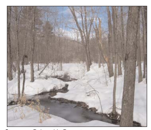
Stream on Delvecchio Property