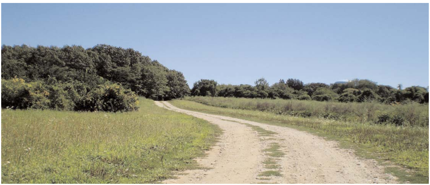
Wick's Nursery Property

The three programs that accommodate Rhode Island's public land acquisitions, the State Land Conservation Program , the Local Open Space Grant Program , and the Agricultural Land Preservation Program are detailed on the following page.