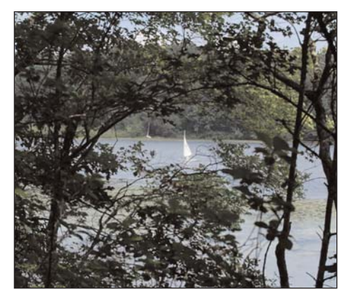
Sailboat on Carr Pond.