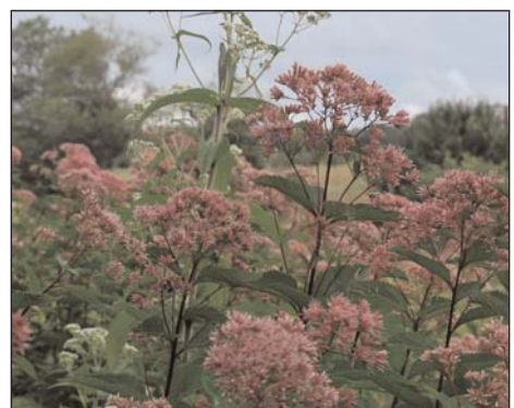
Flowers on Cook Property