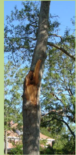
Loss of codominant stems can result in the loss of the entire tree.