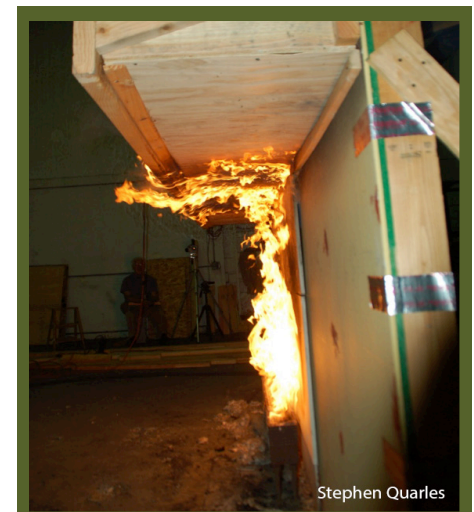
Lateral flame spread was reduced when a combustibile soffit material ignited in this test of a soffited-eave with a combustibile soffit material.