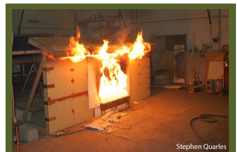
Flame impingement exposure to the underside of the eave, and time-to-ignition of the joists, blocking and fascia was quicker; and lateral flame spread faster, when an open-eave design was used in research experiments.