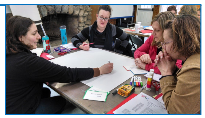
"These award-winning curricula allow teachers from preschool through high school to fulfill state educational standards while teaching about the environment"

While most people equate RIDEM Division of Fish and Wildlife with hunting and fishing, many people do not realize that the Division also provides teacher training opportunities