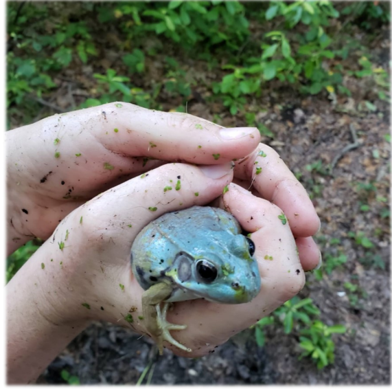
Above: A green frog, found in Cumberland R.I., with a rare genetic mutation which makes its skin blue, rather than the typical green color of its namesake.

Observer and how to participate, follow this <u>link</u> to our instructions on how to download and use the app. If you do not have access to a smartphone, the Division of Fish and Wildlife still accepts observation reports directly.