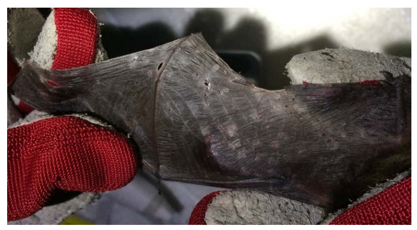
Figure 4- Wing membrane of a little brown bat showing damage caused by WNS

maternity roosts, and forested habitats. As bat populations recover, they will need places to hibernate, feed, and raise their young.