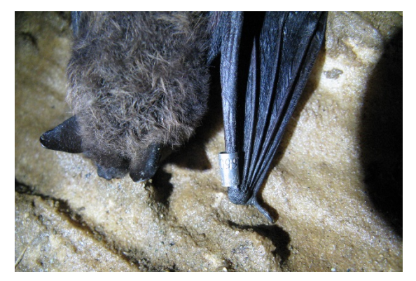
Figure 3- Little brown bat with RI DFW band hibernating in Vermont

Despite the devastating mortality due to WNS, some bats are surviving, even with repeated exposures in WNS-contaminated sites. There is much ongoing, innovative research focused on treatment and controlling the spread of WNS. To ensure that populations have the best chance to recover, we need to protect habitats that are important to bats, including hibernation sites,