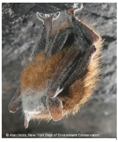
Figure 1- Photo of bat from New York exhibiting telltale signs of White-nose Syndrome

A bat's immune system enters a reduced state of activity during hibernation to conserve energy resources. This strategy has worked for bats for thousands of years but the introduction of a new pathogen has proven to be catastrophic to many North American bat species. The reduced period of immunity allows the fungus to spread unchecked over the bat's body, damaging skin tissues, disrupting the bats metabolism, causing dehydration, and depletion of their fat reserves. Symptoms often include deterioration of wing membranes (patagium) and uncharacteristic behavior such as early arousal from hibernation and flying outside during the daytime in winter, presumably in search of food or water. There is no evidence that Pd poses a threat to humans, domestic animals, or other wildlife.