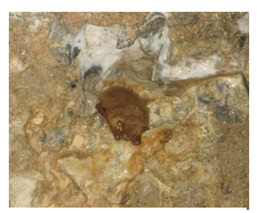
Figure 2- Tricolored bat hibernating in Rhode Island

accepted that the fungus was introduced into North America from Europe, where it has been found to occur. European bat species do not exhibit the same fatal response to exposure, suggesting that bats in Europe and Asia coevolved with the fungus. Given that bats do not migrate across the Atlantic Ocean, it is believed that Pd was somehow transported across the Atlantic by humans. Fungal spores can be spread by humans on clothing, footwear, and equipment. The discovery of an infected little brown bat ( Myotis\ lucifugus ) in Washington state in 2016, approximately 1,300 miles from the westernmost known infected site, likely resulted from the transport of the fungus or spores on something other than a bat.