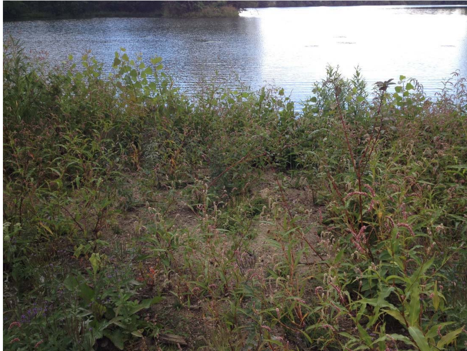
5. Small area of relatively thin vegetation cover in fringe wetland, view to north.