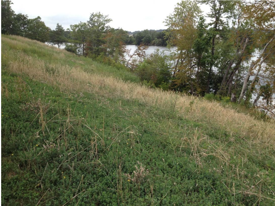
7. Densely vegetated perimeter wetland (50' buffer) view to west.