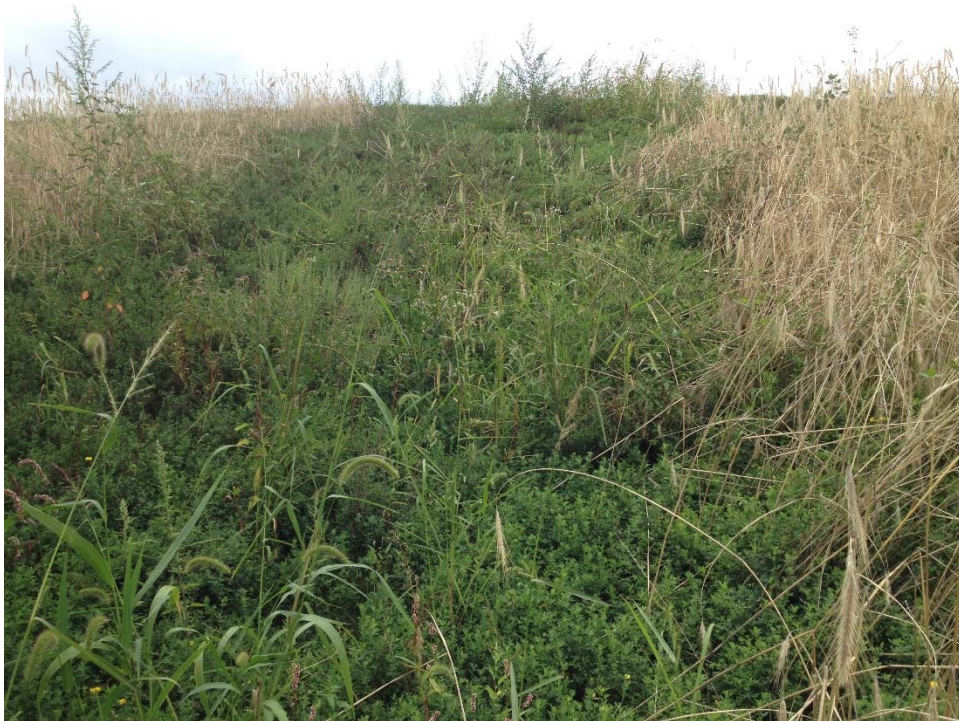
8. Repaired former erosion washout in 50' buffer, Parcel C-1 north, view upslope to south.