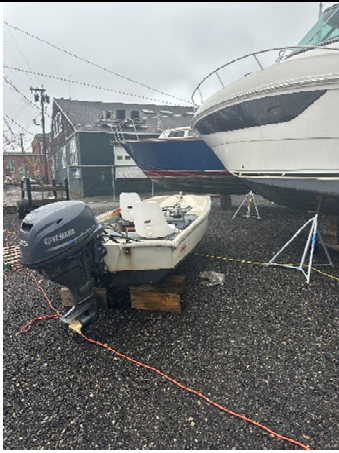
View of temporary cap area.