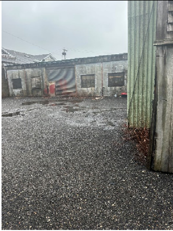
View of temporary cap area.

If you have any questions or concerns, please contact the undersigned at 401-723-9900.