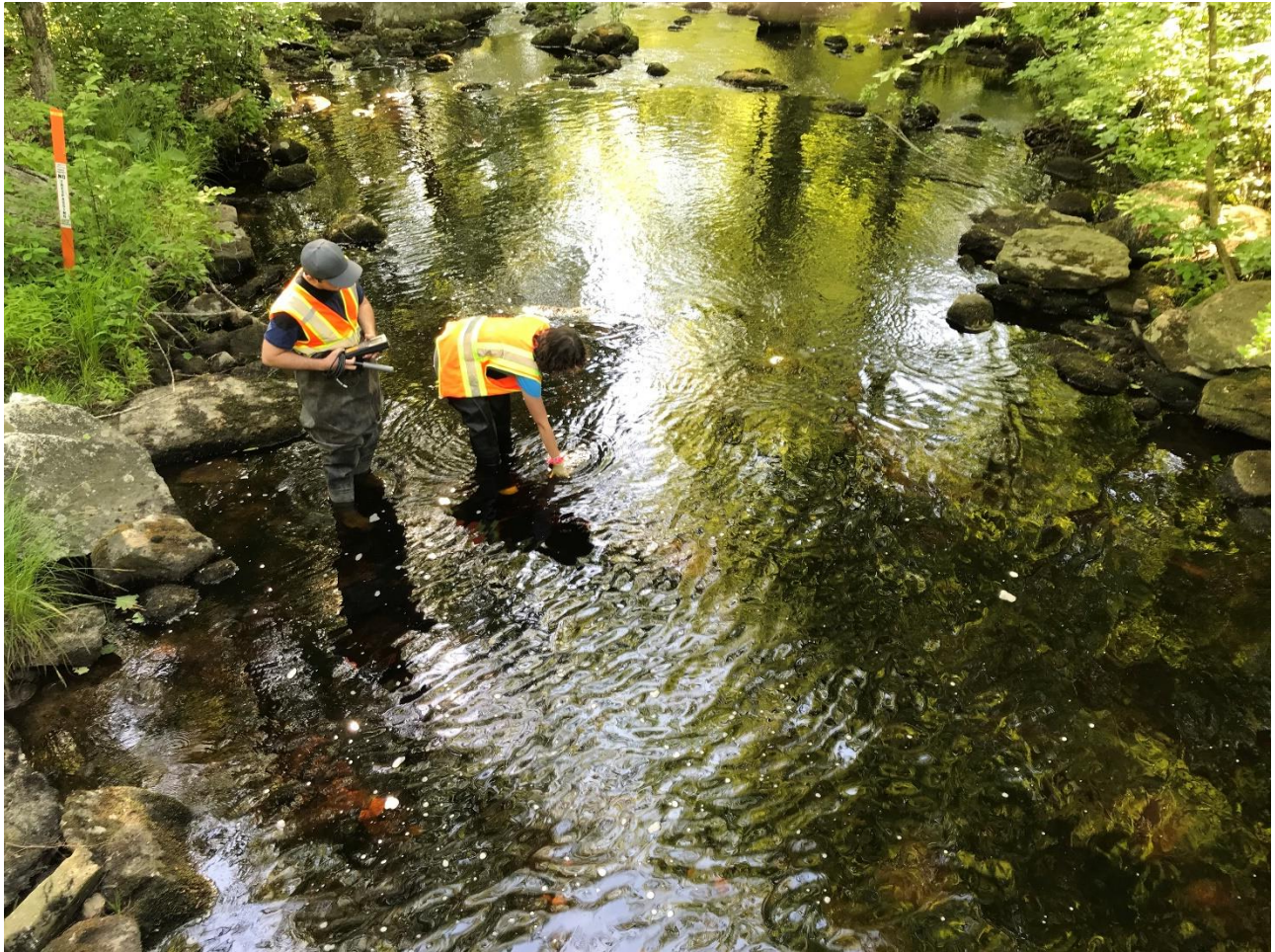
Hemlock Brook – Foster, Rhode Island

Rhode Island Department of Environmental Management Office of Water Resources 235 Promenade Street Providence, RI 02908