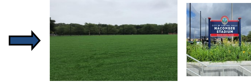
A couple of the restored sites participants will experience as they ride through Central Falls