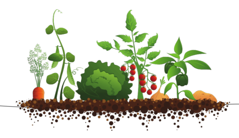
Ensuring the perfect place is also a safe space

Tip: When you need brownfields expertise, a qualified environmental professional (QEP) can help you complete a site assessment. FREE help also is available from <a href="State and Tribal programs">State and Tribal programs</a> and the <a href="U.S. Environmental Protection Agency's (EPA) Targeted Brownfields">U.S. Environmental Protection Agency's (EPA) Targeted Brownfields</a> <a href="Assessments">Assessments (TBA) program</a>.