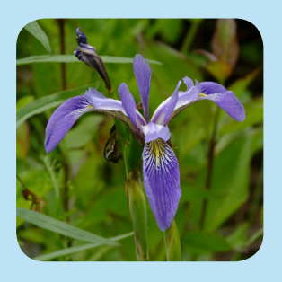
Native blooms like those of swamp milkweed Asclepias incarnata, cardinal flower Lobelia cardinalis, and blue flag Iris versicolor add color and attract pollinators to the rain garden.