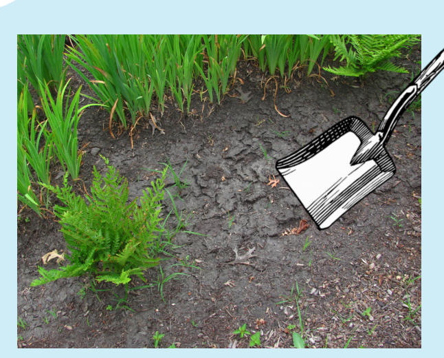
Solution Carefully remove top layer of sediment with a flat shovel to prevent or stop clogging. Add fresh mulch if needed.