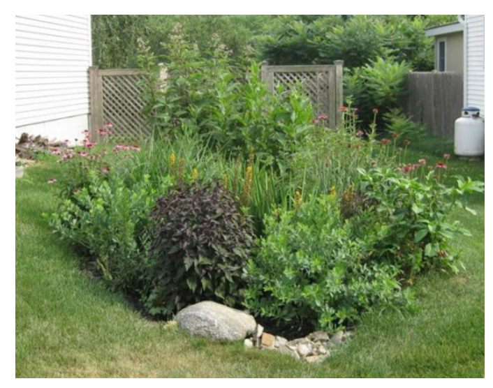
Above, image of residential rain garden courtesy of University of New Hampshire.

Rain gardens are designed to capture stormwater runoff from nearby impervious areas like rooftops and driveways so that rainwater can soak into the ground below, where pollutants are gradually filtered out instead of entering waterways. Simple inlet and outlet structures made from pipe, stone, or both help water enter and leave the garden. Rain gardens can be planted with a variety of native plants and maintained to appear anywhere from manicured to naturalistic.