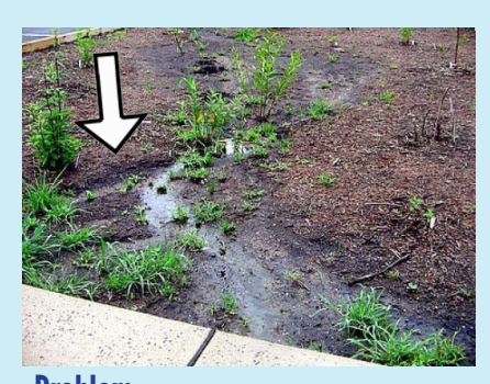
Problem Deep gullies are forming within a rain garden.