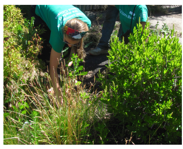
Volunteers maintain the rain garden at Southside Cultural Center in Providence by weeding.

Any landscaped area requires maintenance—rain gardens are no different. Along with basic steps for maintaining plant health such as watering and weeding, rain gardens also require some attention to how water moves in and out and keeping edges and berms intact to prevent erosion from taking place. Regular inspections and maintenance will keep your rain garden healthy and allow it to soak up and clean plenty of stormwater.