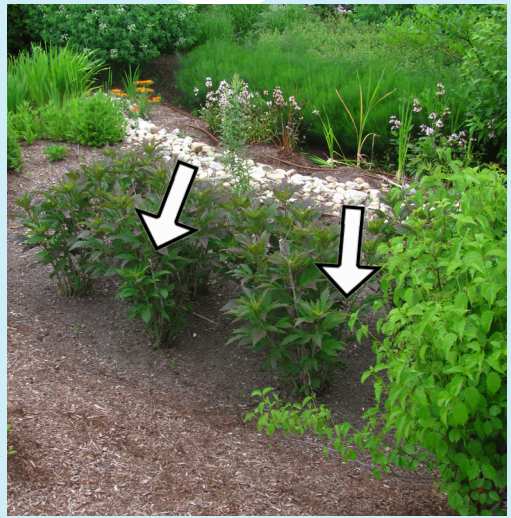
Problem The lowest points in the rain garden have begun to gather dark sediment build-up over the brighter mulch layer.