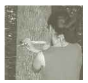
Forester measuring tree for managment plan development

A forest management plan is a good way for a landowner to define and organize his or her objectives. The plan describes and maps the natural resources of the property and defines a program