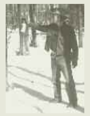
Forester marks trees to be cut in preparation for timber sale

An owner (or potential buyer) of woodland may need to know the volume and quality of the timber on a property. The forester can provide this information by doing a timber cruise or forest inventory with a site analysis.