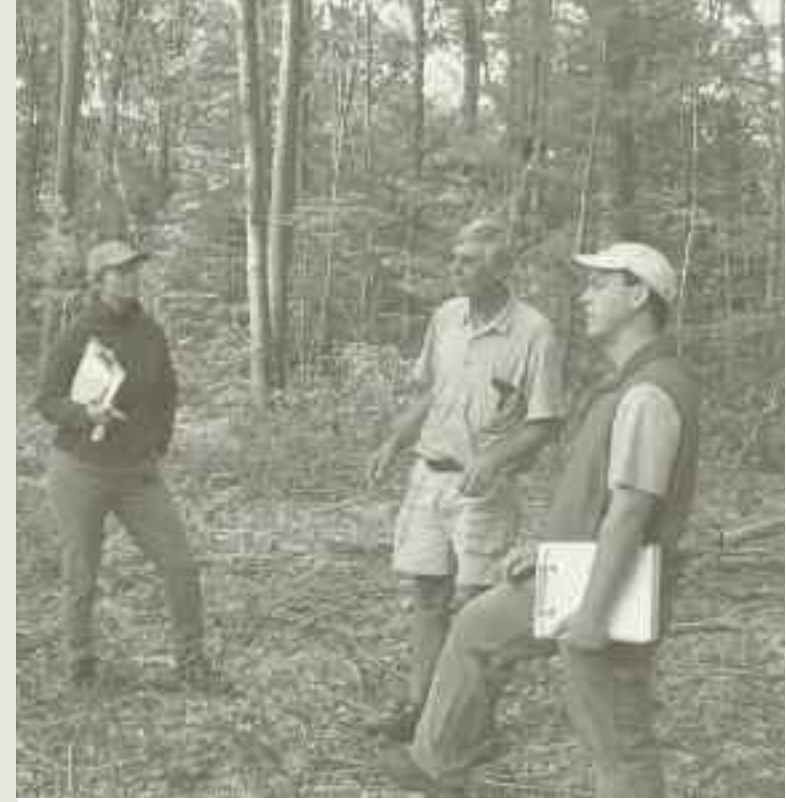
Foresters discussing conservation opportunities with a landowner

Timber stand improvement (TSI) may include any combination of treatments designed to improve the growth and quality of timber. Thinning constitutes most of the TSI work performed in New England forests. However, TSI work may also include pruning and planting.