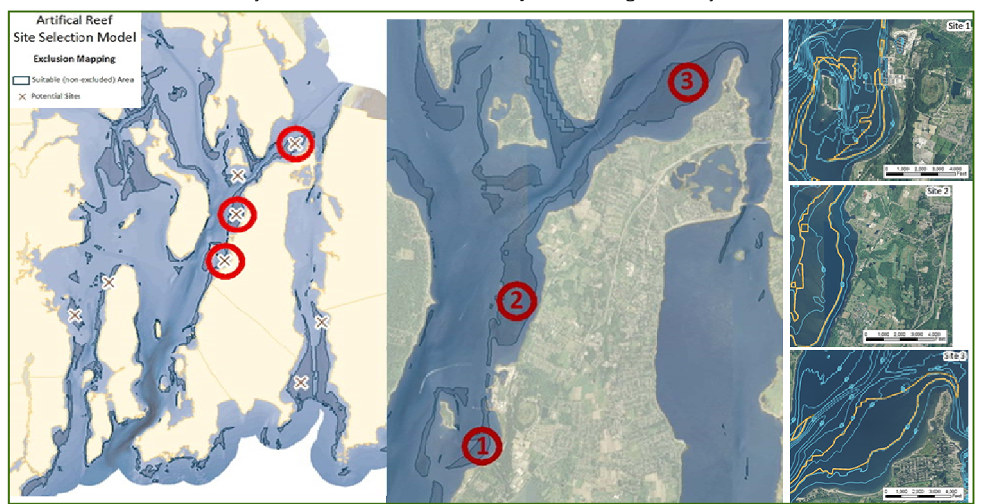
Figure 1. Artificial reef site selection model output for Narragansett Bay (left), and proposed reef sites in the East Passage and lower Mount Hope Bay (right).

At the end of the project period in 2017, researchers will analyze the collected data to determine the benefits of artificial reefs in RI. The data collected from this study will be used to finalize an Artificial Reef Plan for the State of Rhode Island. The plan will not only provide an overview regarding the proper citing and materials to be used in artificial reef construction but will make recommendations for future projects in Narragansett Bay.