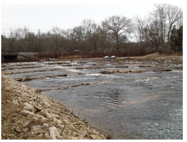
Bradford Dam finished.

In conjunction with the compleemergency or violation please call the tion of the habitat restoration projects on the Pawcatuck River, DFW