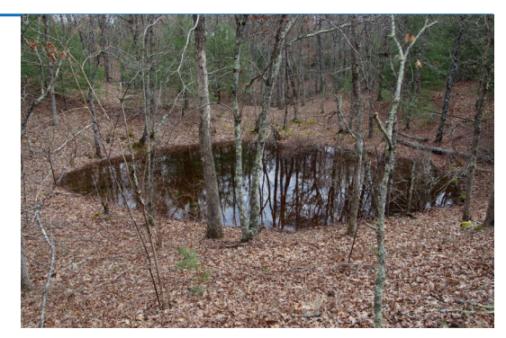
Vernal Pool in Arcadia Management Area, R.I.

March is the month of wild, unpredictable weather, punctuated by snow, cold rain, sudden thaws, and occasional warmth that hearkens to the approaching spring. It is the month of subtle change on the landscape, as skunk cabbage flowers bloom in otherwise dormant swamps. To me they look like little gnome hats peeking out of the mossy swamp bed, but I tend to be whimsical... As snow melts and rainwater runs along the ground, mysterious, glassy pools appear in the forest. And then, the hush of the forest is broken. Peep...peep., peep., peep., peep., PEEEEEEEP.