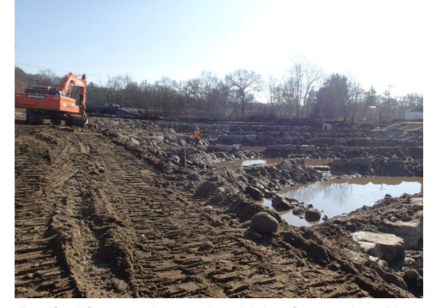
Bradford Construction - weirs with low flow outlets.

During this past winter, the construction of a rock ramp fishway was completed at the Bradford Dam on the Pawcatuck River. To date, numerous partners and funding sources have completed fish passage projects and improvements to the White Rock Dam, Potter Hill Dam, Lower Shannock Dam, Horseshoe Falls Dam, and Kenyon Mill Dam. These improvements, along with the completion of the Bradford rock ramp fishway, combine to provide access to over 1,900 acres of spawning (egg deposit) and nursery habitat, with over thirty miles of riverine spawning habitat for river herring and American shad. River herring and shad now have access starting from Little Narragansett Bay in Westerly to the nursery and spawning habitat in the upper sections of the Pawcatuck River, along with several large impoundments including Chapman,