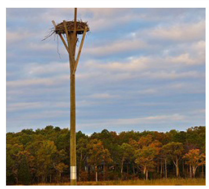
Osprey nest, USFWS