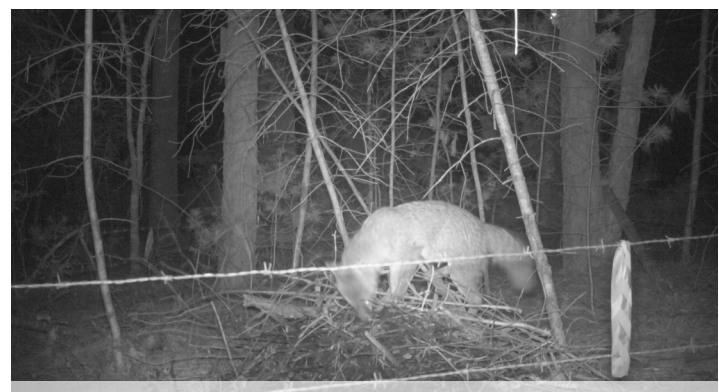
Gray foxes were frequent, curious visitors to the hair snare stations, along with other mammals.

To gather more information about Rhode Island's bear population, the RIDEM Division of Fish and Wildlife funded a project through the federal Wildlife and Sport