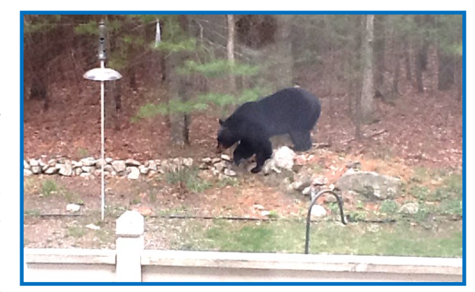
Black bear seen exploring a back yard in West Greenwich

The American black bear originally ranged throughout all of the forested portions of North America, including all of what is now known as New England. It is the only species of bear that occurs in the eastern United States. Historical records are scarce, but it is likely that bears were extirpated (became locally extinct) from Rhode Island sometime before 1800. The clearing of land for agriculture