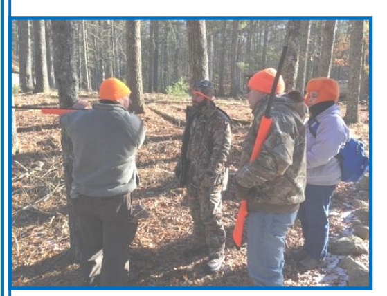
Participants learn about safe gun handling in the field.

during the field training course when you put an orienteering compass in a student's hand and ask for the bearing to and from a certain object in the distance. Something this simple can mean the difference between walking into the woods and safely returning to the parking area, and walking into the woods and getting lost, sometimes with tragic consequences.