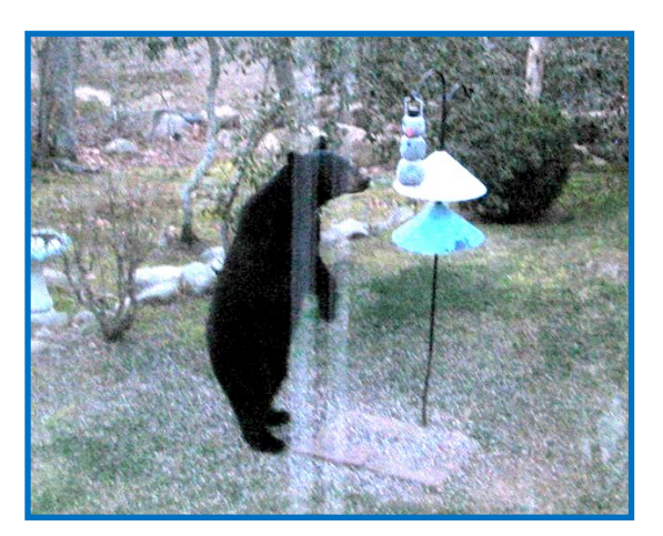
This black bear has made a habit of going after bird feeders in Charlestown, R.I.

Breeding season for bears occurs in June or early July, with adult male bears competing for breeding rights with as many females as possible. Female bears will generally not breed before they are at least three or four years old. Males will usually not achieve enough "status" to breed until they are much older. Adult females breed every other year. The cubs are born in the den in January and stay with their mother until they are one and a half years old. The average litter