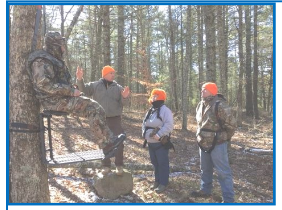
Participants get a hands-on experience in a field training provided by the DFW Hunter Education Office.

When I began teaching hunter education courses in 2004, the only option Rhode Island residents had for hunter education courses was to attend an in-person, classroom-style course and pass a written exam at the end. This was true for both hunter education and bow hunter education courses. Now, more than a decade later, we offer an online version of both curricula. Students can take either the hunter education course or the bow hunter education course online, complete a knowledge assessment online, and then take the in-person exam to obtain their course completion cards.