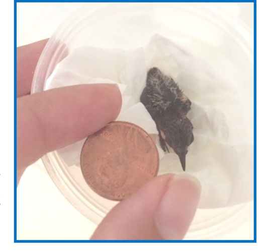
A baby hummingbird that was displaced from its nest beside a penny to show size.

Baby animals are commonly found in spring and summer, but just because you see a baby sitting in your yard by itself does not necessarily mean it is abandoned. Many parents will leave their young in a safe place while they go out to find food. Animals that commonly do this are deer and rabbits. If you do not notice an injury, just let them stay where they are and leave them alone. Any baby with an injury should be brought to the clinic right away. Baby animals cannot regulate their own body temperature and should be put on a heating pad set on LOW or given a hot water bottle (any bottle or jar will do) to snuggle against during transport. Just make sure to secure the bottle so it does not roll onto the animal (s).