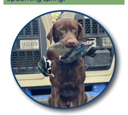
Gauge also loves curling up on the couch or playing with his best bud Trigger, the yellow lab.