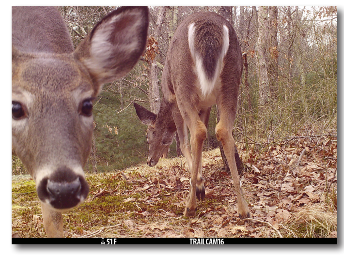
You can see how the white-tailed deer gets its name in this photo. Check out all that white fluffy hair on this deer's tail! When deer are afraid or running from danger, they raise up their tails like a flag as they run. These two don't look too scared...They seem pretty interested in our trail camera!