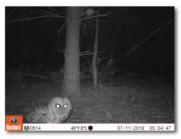
Whooo's there? It's a barred owl! The barred owl is one of the most common owl species in Rhode Island. They have been spotted all over the state, from deep in the forest all the way to downtown Providence! Listen for their funny hooting call, which sounds like they are saying, "Who cooks for you? Who cooks for you all?"