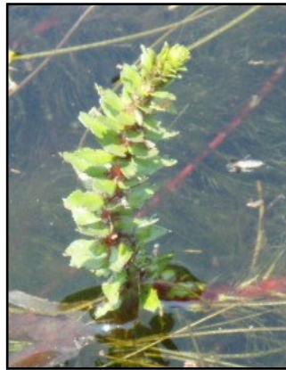
Emergent spike with bracts and tiny flowers