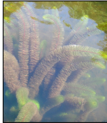
The bulk of the plant grows under water