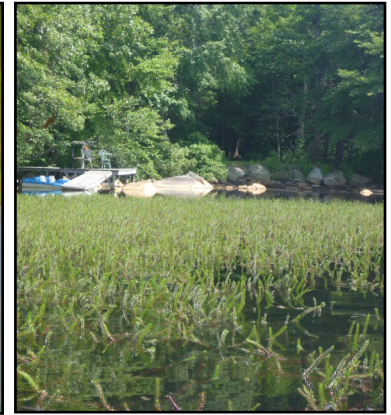
Bracts above the water surface make paddling difficult