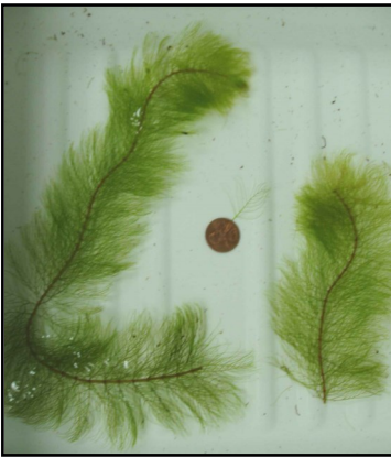
Size of variable milfoil relative to a penny