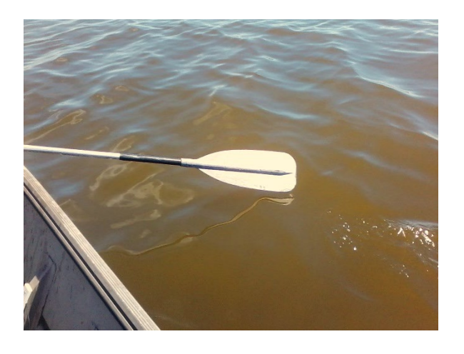
Figure 2: Red water patch caused by rust tide bloom of Margalefidinium polykrikoides on Ninigret Pond 30 August 2016.