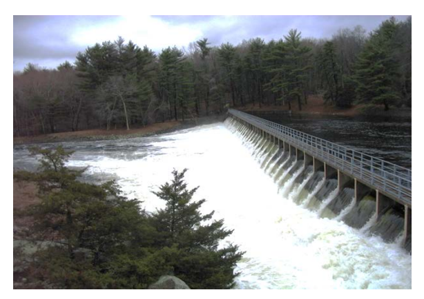
Figure 3: The Gainer Dam spillway at the Scituate Reservoir at 10:30 a.m., March 31st, 2010. Flow was an unprecedented 2.5 feet over the flashboards at a pool elevation of 287.80 feet. See Figure 3 for the spillway on a normal day, with only a trickle flowing over the flashboards.

heaviest rain was projected to hit further north, impacting the Blackstone River, as well as the Taunton River and lower Merrimack Valley in Massachusetts. But Mother Nature had other plans.