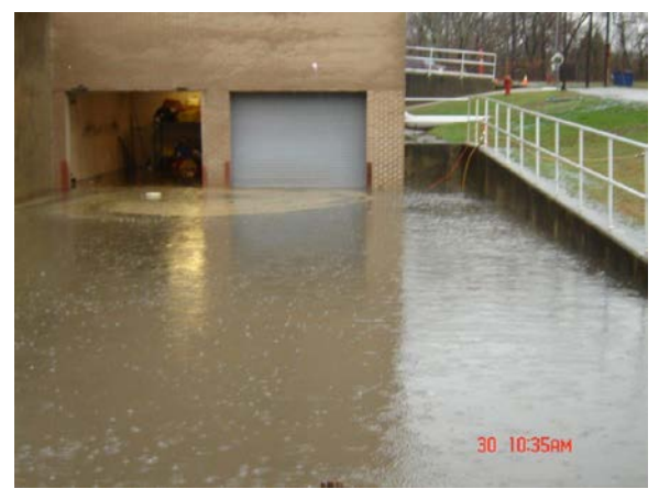
Figure 23: Westerly's lower garage filling with overflow from the overwhelmed plant uphill on March 30<sup>th</sup>, 2010. Eight feet of water eventually found its way to this low spot. (Westerly)

level alarm, indicating extremely high flow passing through them. Several were ultimately inundated and knocked out by the rising river. Scott Duerr, Project Manager at the Westerly facility, was stymied in his efforts to reach the problem stations. "Around ten at night (March 30th) we lost our pump station at New Canal. We headed out to check it out, [but we] couldn't even get down the road. The river was overflowing." The Pawcatuck River would crest at just over fifteen feet, more than double its flood stage. Most of the town was without power and significant portions of it were under water.