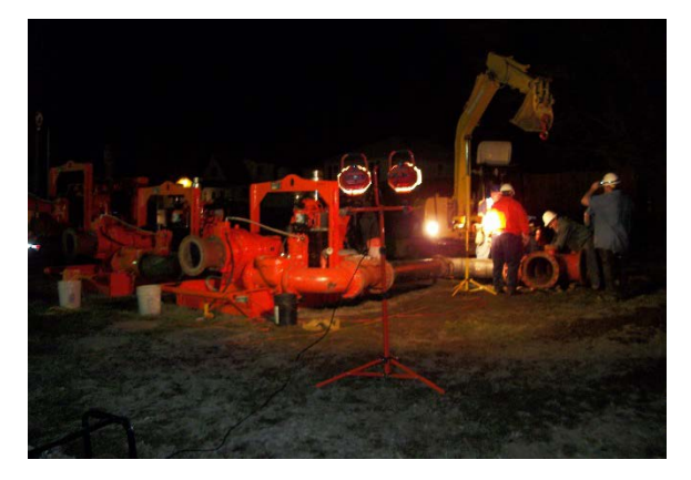
Figure 20: Bypass pumping being assembled at the Pontiac Avenue Pumping Station.

segments of heavy piping into place and then making the connections. Assistant Maintenance Supervisor Randy Sposato was forced to improvise several times during the process. First, he hired a tracked excavator to come and maneuver the giant pumps into position around the backside of the pump station instead of using a crane to lift the pumps up and over as they had done in the past. This ended up saving considerable time.