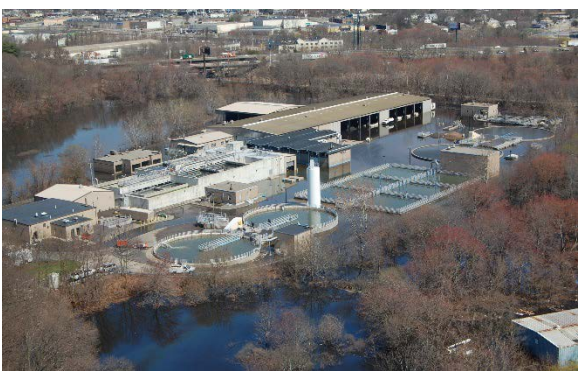
Figure 10: West Warwick two days after the crest of the Pawtuxet.

the water and deposited outside the fence. "Everything was floating in the swamp. We had to send a party out afterwards to grab all the stuff because vou couldn't leave it there." An untold amount of debris had floated into the plant as well. Garbage, tree limbs, anything the swollen river had picked up before reaching West Warwick wound up stuck in treatment tanks or strewn across the ground, even inside buildings. "Probably the good first week was cleaning," remembers Eldridge. "Every pump room that West Warwick has was twenty feet full of wastewater. That all had to be pumped out and fully cleaned." Brian Lavallee recalls that process: "I can remember when the water went down. walking up to the top and opening up the hatch to look into the [approximately twenty-foot deep] pump room, and the water was flush to the top of the hatch. We just looked and said 'Oh, this is going to be fun!'"