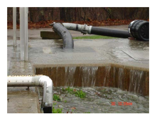
Figure 22: Heavy flows arriving at the Westerly wastewater treatment plant from townwide flooding upstream overwhelmed the plant's influent structures. Crews here have installed temporary pumping to help relieve the flow and keep it in the system. (Westerly)

The treatment plant is high enough on the river bank that it was not flooded by the Pawcatuck directly, but the massive flow of wastewater coming through the town's collection system was causing other problems. By Tuesday morning, the plant's headworks and primary clarifiers were overflowing uncontrollably, and the water ran down around the operations building and began to pool in a garage on the first floor. "[T]he water was probably eight or nine feet-deep in that garage," says Westerly Chief Operator Tim Costa. "And the sump pump that's in there, that also pumps it back into the system, just couldn't keep up with it."