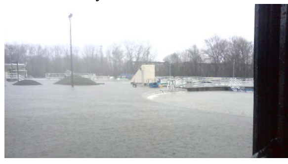
Figure 7: West Warwick's five-foot high secondary clarifiers are overtopped by the rising Pawtuxet on Tuesday afternoon, March 30th. (West Warwick)

primary tanks was under water," says Eldridge, remembering how the Pawtuxet River surged ever higher into the plant. Watching the one-hundred-foot diameter clarifiers go under was especially dramatic; akin to watching an aboveground pool fill from the outside-in. "The guys were trying to protect the power situation coming into the plant with sandbags, but at that time the secondaries were overtaken and we had to back away ... and evacuate to the front of the plant." Staff rode Levesque's payloader to dry land near the facility's front gate. Eldridge phoned RI DEM's Patenaude and the West Warwick town manager at around 12:30 p.m. to report the unthinkable—the facility was being evacuated. The river continued to creep into the plant until it crested at 20.79 feet on Wednesday.