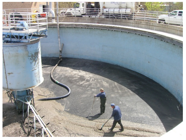
Figure 9: West Warwick staff manually pushing sludge to the center of idled primary clarifiers. From there, the sludge would be pumped away in tanker trucks.

the clarifiers and the solids to settle out. Still needed was electricity to power the large boom arms that sweep the solids into troughs for collection and removal. These were back online in two weeks. In the meantime, portable pumping systems were brought in to remove the solids as they continued to enter the facility. Getting the sludge to the center of the tanks, however, had to be done the oldfashioned way—with manual labor.