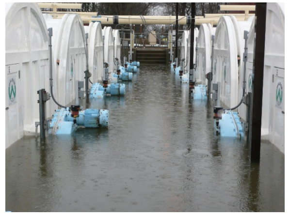
Figure 21: Bristol's Rotating Biological Contactors going under water as local flooding throughout the town makes its way to the treatment plant on March 30th, 2010. (Bristol)

(RBCs). This system is comprised of large mesh drums that sit partially in wastewater and slowly rotate to grow a layer of bacteria that consume waste. The drums and the motors that turn them were submerged as the water backed up. The motors did turn back on and kept working after the flood, but later began to fail one by one and had to be replaced.