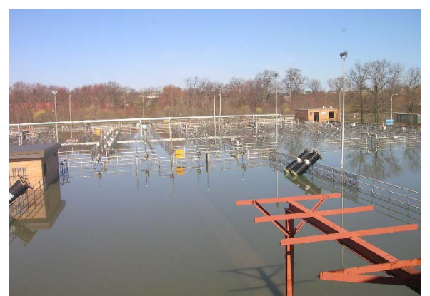
Figure 16: Warwick's wastewater facility on Saturday, April 3rd as flood water continued to be pumped back over the berm.

At the same time, work was underway to restore the buildings and physical facilities at the plant. Water has an astounding capacity for destruction, and the WSA had been sitting in six feet of it. Pat Doyle was on-site throughout the recovery. Like West Warwick, floodwaters had not damaged the structural integrity of Warwick's tanks or buildings, but the buildings had to be gutted; everything was ripped out and rebuilt. "[E]very wire in the place was pulled and replaced," said Doyle.