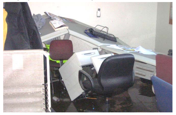
Figure 17: A once ordered office at the WSA in disarray after flood waters receded.

happy; they had been fed very well. And it was really hot and humid, it was like Little Shop of Horrors when you walked in."