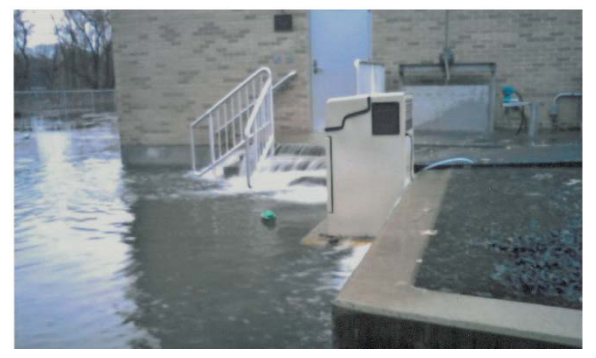
Figure 8: At higher ground, water from the flooded town makes its way into West Warwick's mostly submerged treatment facility, and out the doors of its headworks building. (West Warwick)

About 20 MGD was flowing in to the plant at the time—four times the facility's normal rate—and a lot of unwanted material with it. Debris is normally collected and removed from the incoming flow by automated bar racks at the headworks. This system went offline as well, and the incoming flow backed up on clogged debris as it tried to enter the plant. "We were afraid to open the doors to the headworks [building]," says Lavallee. "[Water] was just pouring out underneath the doors."