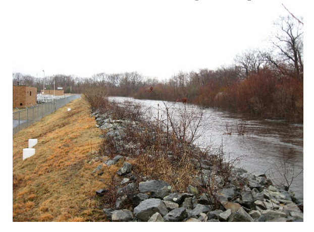
Figure 12: At 14.7 feet, the Pawtuxet threatens but does not overwhelm the 18-foot levee at the Warwick wastewater facility on March 15th. (WSA)

were held in the wake of the mid-March storm: "[A]s we were starting to analyze our vulnerabilities, we were focused on our collection system and things along the river, and our Oakland Beach pump station that's on [Greenwich Bay]. Really hadn't even started looking at the plant."