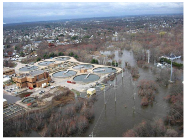
Figure 18: The Cranston wastewater treatment facility after the Pawtuxet had begun to subside.

checking pump stations, delivering what few sump pumps were available to homes with flooded basements. Chief Collections Operator Anthony DeMaio echoes the frustration of trying to operate in the flooded city: "We were getting called out to sewer clogs but we couldn't do anything. Most of the pump stations were down, and the manholes were full of water."