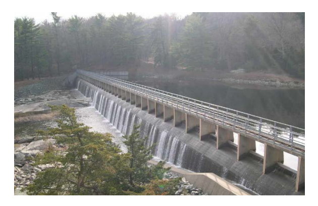
Figure 2: The Gainer Dam spillway on a normal day, with only a trickle being added to normal flows that come from the dam's central outlet, which feeds the North Branch of the Pawtuxet River. See Figure 3 for an image of the spillway's raging torrent on March 31<sup>st</sup>, 2010 (NWS/NERFC)

The 3,200-foot-long Gainer Dam is located at the southern end of the Scituate Reservoir. The massive earthen dam was built for water storage, and today provides sixty percent of Rhode Island's population with drinking water. It is designed to collect and hold as much water as possible, only releasing excess water into the North Branch of the Pawtuxet River when the reservoir level exceeds the height of its spillway.