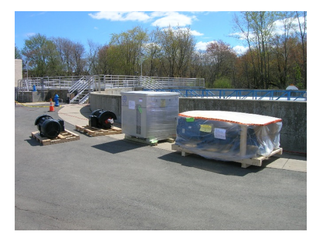
Figure 24: On April 20th, 2010, new equipment arrives at the West Warwick Regional Wastewater Treatment Facility—as water-absorbing foliage appears around the plant—heralding the start of the long rehabilitation of plant equipment.

loods like the one that struck Rhode Island in 2010 are often reported in dry numerics: inches of rainfall over a period of time, water heights and velocity of flows. They are remembered with lines on walls, either drawn by hand or left by the water as stains of silt and mud. The personal toll natural disasters take on everyday people are worth remembering, as are the desperate, often uplifting stories of those who fight to keep the basic services of communities functioning in the face of catastrophe. Such is the case of Rhode Island's wastewater industry. As told by those who experienced it firsthand, the floods and their aftermath were about more than just long hours of overtime on little sleep; it was a coming together of like-minded people towards a shared goal, a public goal. It is a much needed comfort in the aftermath of disaster to be