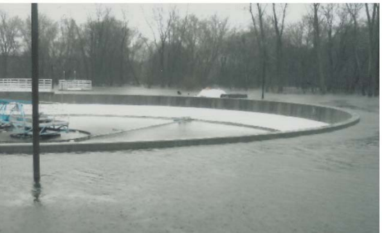
Figure 6: The Pawtuxet River rises towards the fivefoot flood protection walls of West Warwick's secondary clarifiers on Tuesday, March 30th as plant staff evacuate. (West Warwick)

Marc Levesque was behind the wheel of the payloader. A technician for the facility's compost program, Levesque found himself shuttling equipment, sandbags, and personnel around the flooded plant in the bucket of his payloader. Heavy rain was still pouring down. The staff had been working in this fashion for only about an hour when "[w]e got a surge from somewhere," Levesque remembers, "the water . . . just rose. " The last thing the bucket-borne crew was able to do was refill the oil tanks for the screw pumps located in the back of the plant. The payloader console lit up with alarm lights as the water, now at head-height, began to flood the engine compartment. Levesque called out that they had to leave now or start swimming. It was around 11:00 am. The payloader plied its way back towards the front of the plant, and high ground.