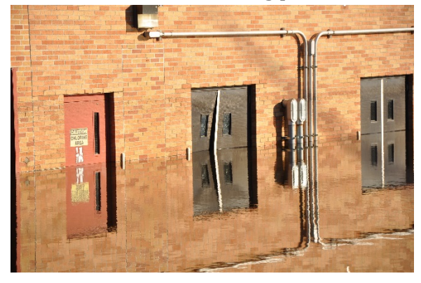
Figure 15: Warwick's disinfection building, where operators had been working to restore power when the nearby levee was overtopped. (WSA)

while another consulted an image of the plant on Google Earth and shouted directions. Once located, they were able to lower a hose into the manhole and pump directly from the facility's storm drain system. This allowed water to be pumped out of the plant from the lowest possible point, and eliminated the need to move hoses around chasing puddles.