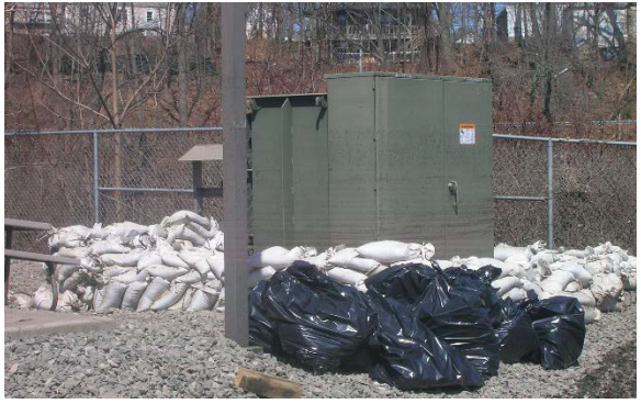
Figure 11: With flood waters long gone came remnants of frenzied attempts to sandbag critical components at the West Warwick Regional Wastewater Treatment Facility.

Disaster relief and recovery contractor Clean Care was hired to handle most of the physical cleaning, especially in the buildings. A crew of no less than twenty-five worked to remove the literal tons of mud and waste that had blanketed the plant. "Miracle workers, what those people did," says DiCaprio, without a hint of hyperbole. "We'd still be working on it if it was just us that had to do that. It would have taken years." Once the plant was clean, the rest of the operators, maintenance staff, and contractors could come in and begin restoring the treatment processes.