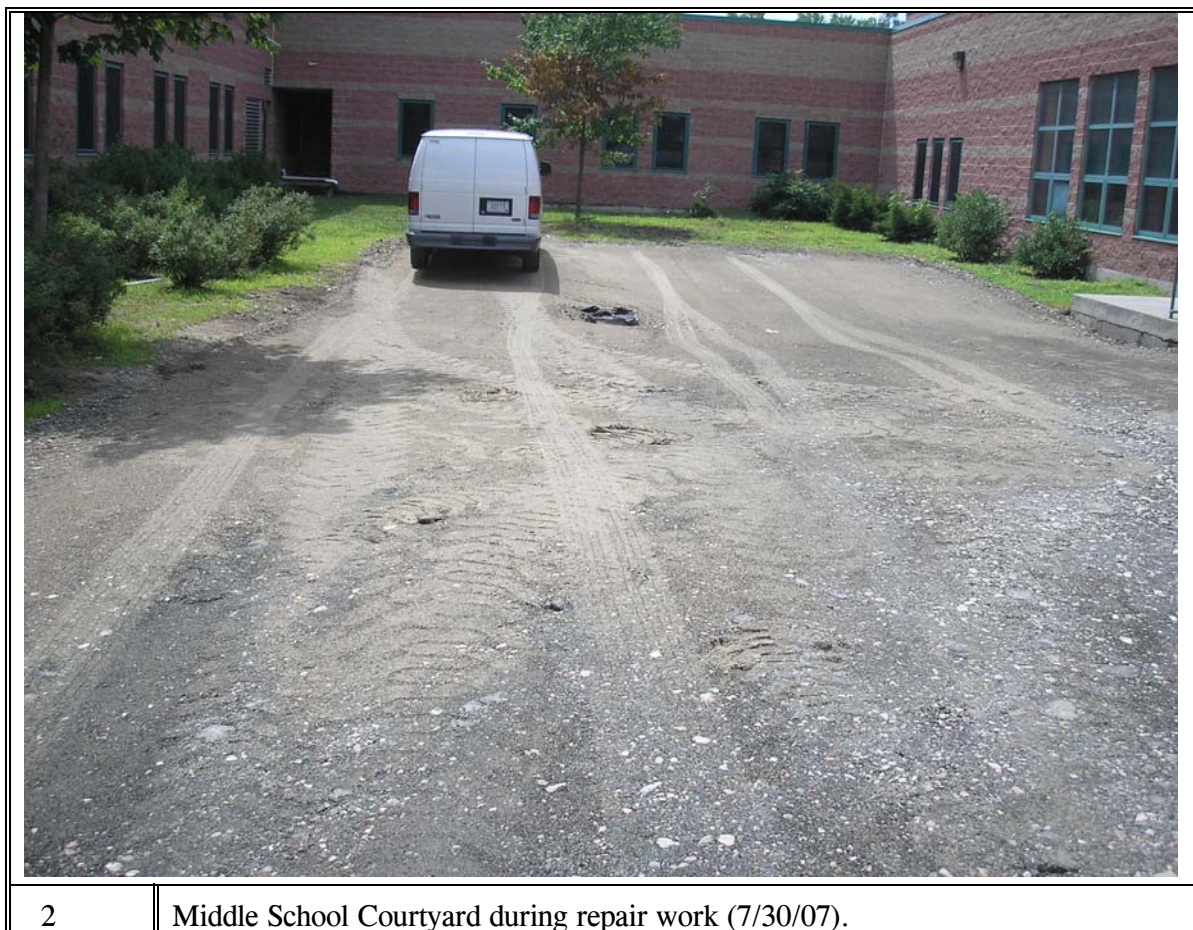
Middle School Courtyard during repair work (7/30/07).