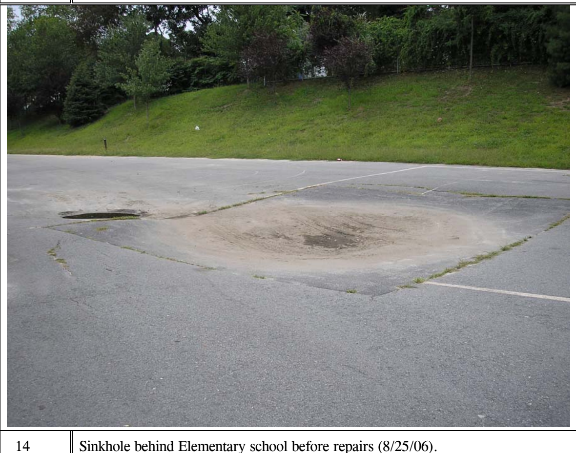
Sinkhole behind Elementary school before repairs (8/25/06).