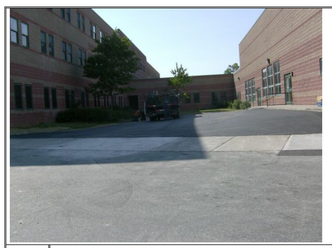
Middle school courtyard after repairs completed (9/4/07) 3