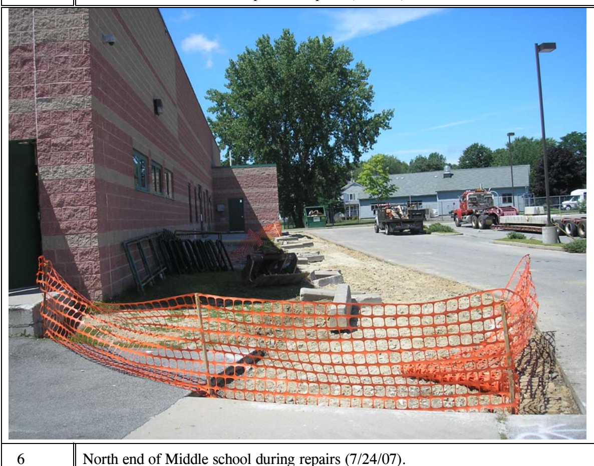
North end of Middle school during repairs (7/24/07).