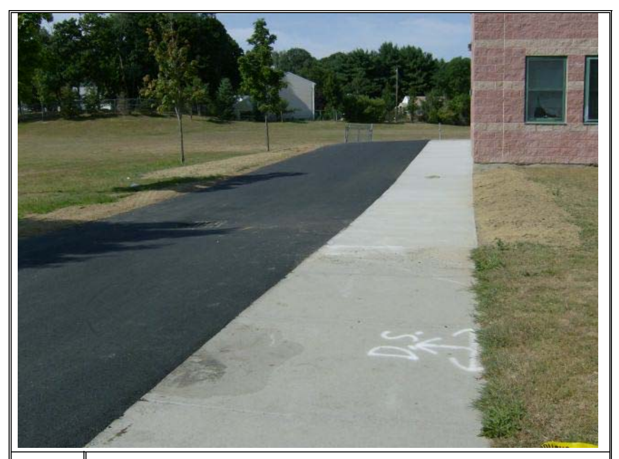
13 Driveway on southern end of Middle school after repairs completed (9/4/07)