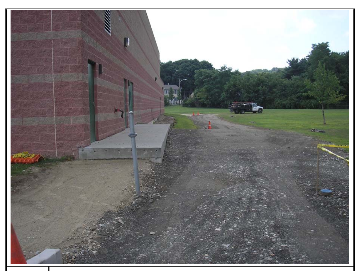
9 Back of middle school gym during repairs (7/30/07)