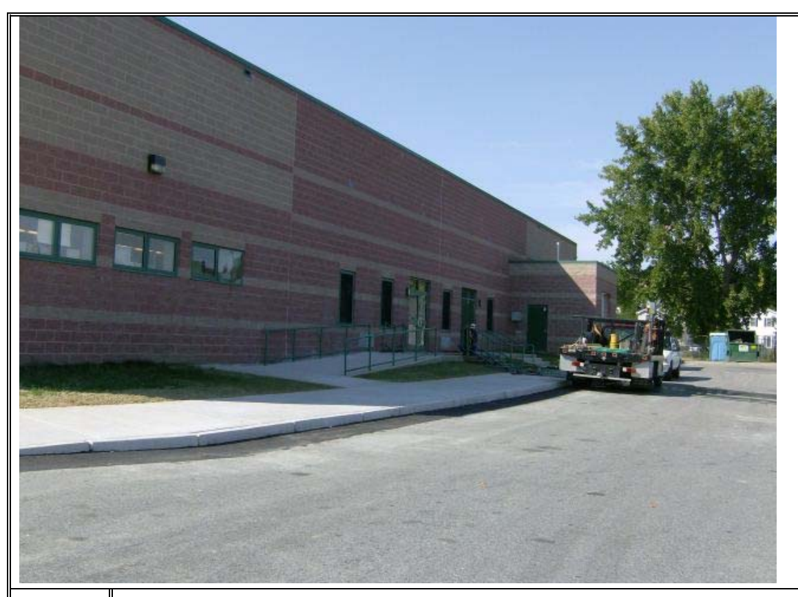
North end of Middle school after repairs were completed (9/4/07)