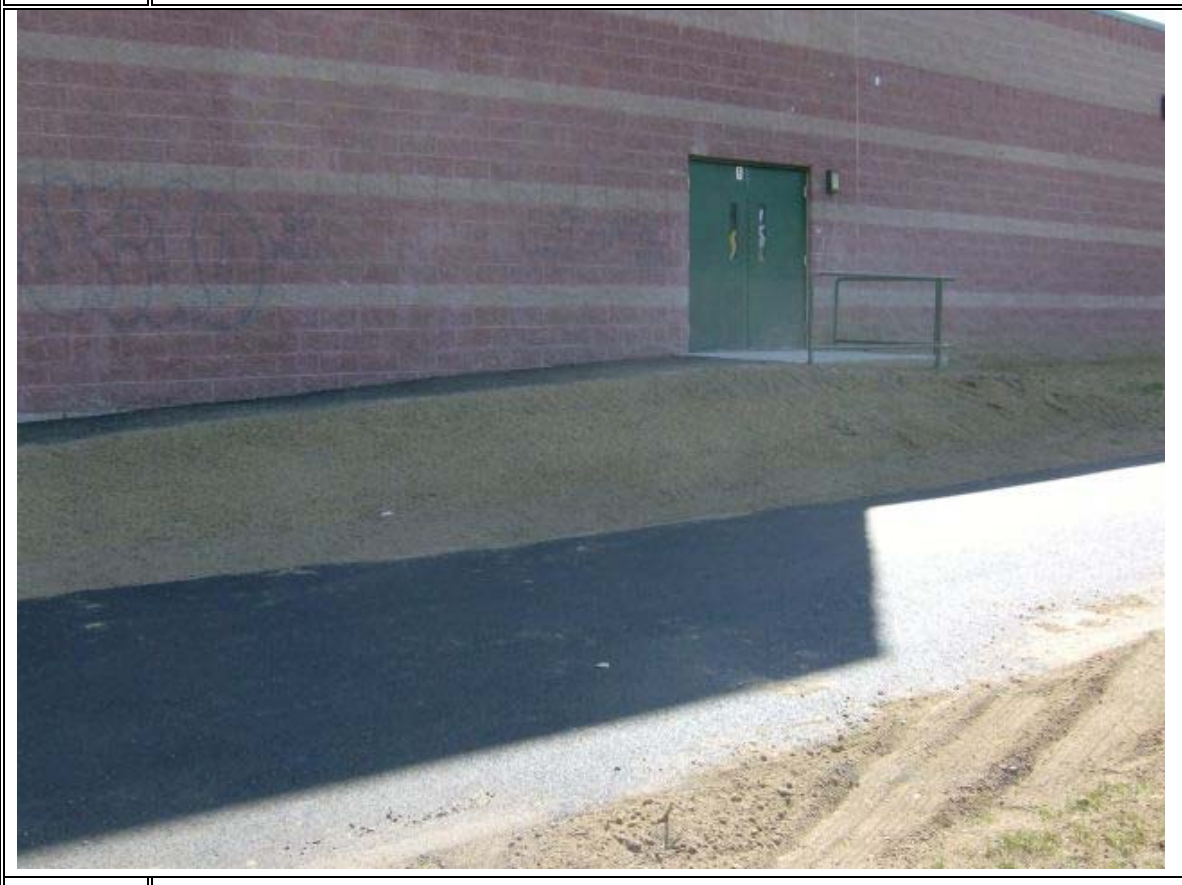
Back of Middle school gym after repairs were completed (9/4/07).