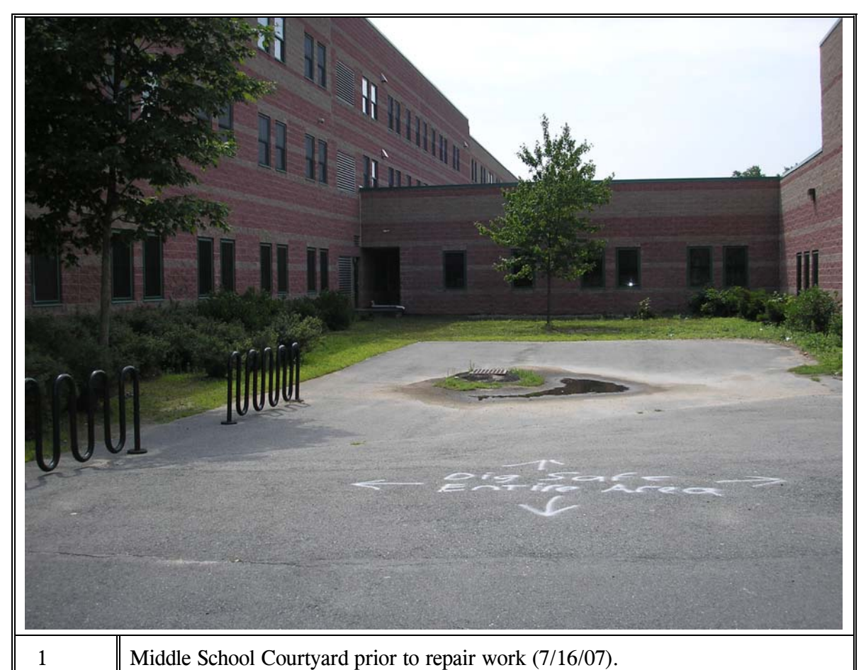
Middle School Courtyard prior to repair work (7/16/07).