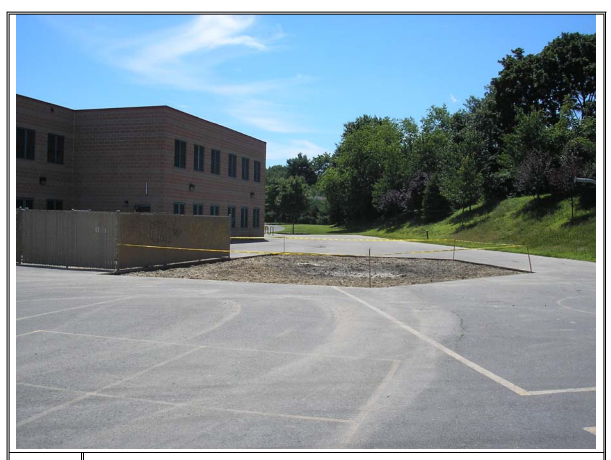
15 Sinkhole behind elementary school during repairs (7/24/07).