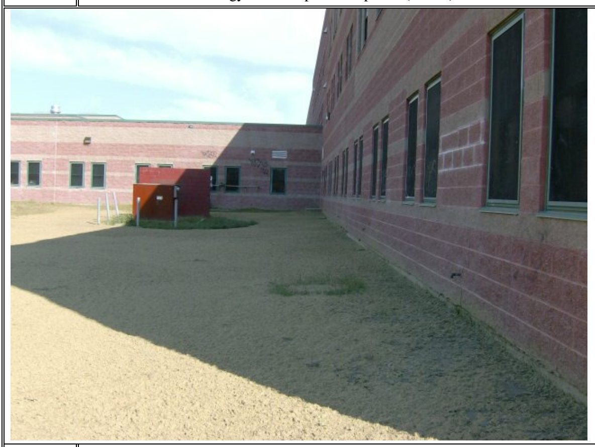
Middle school transformer area southwest of building after repairs completed (9/4/07).