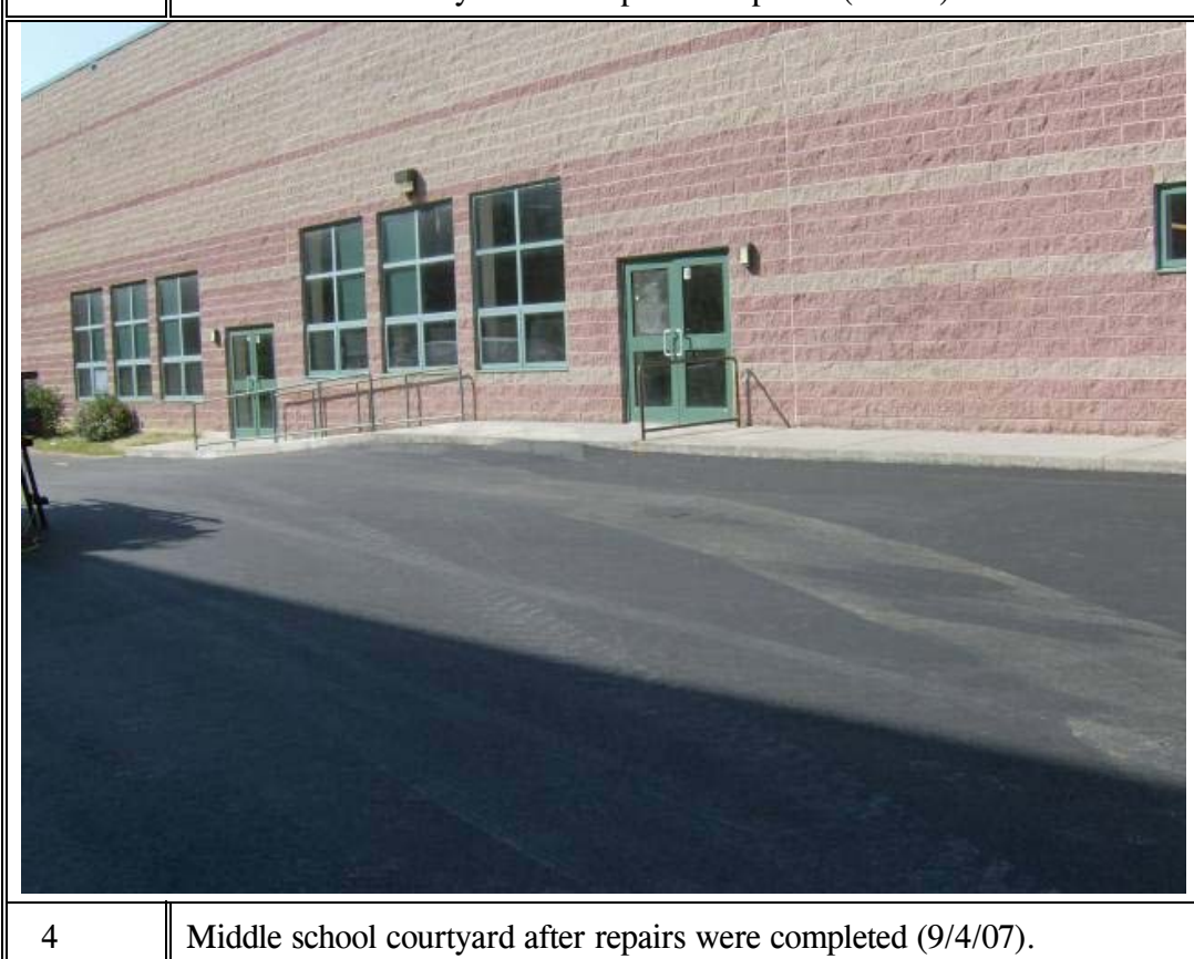
Middle school courtyard after repairs were completed (9/4/07).