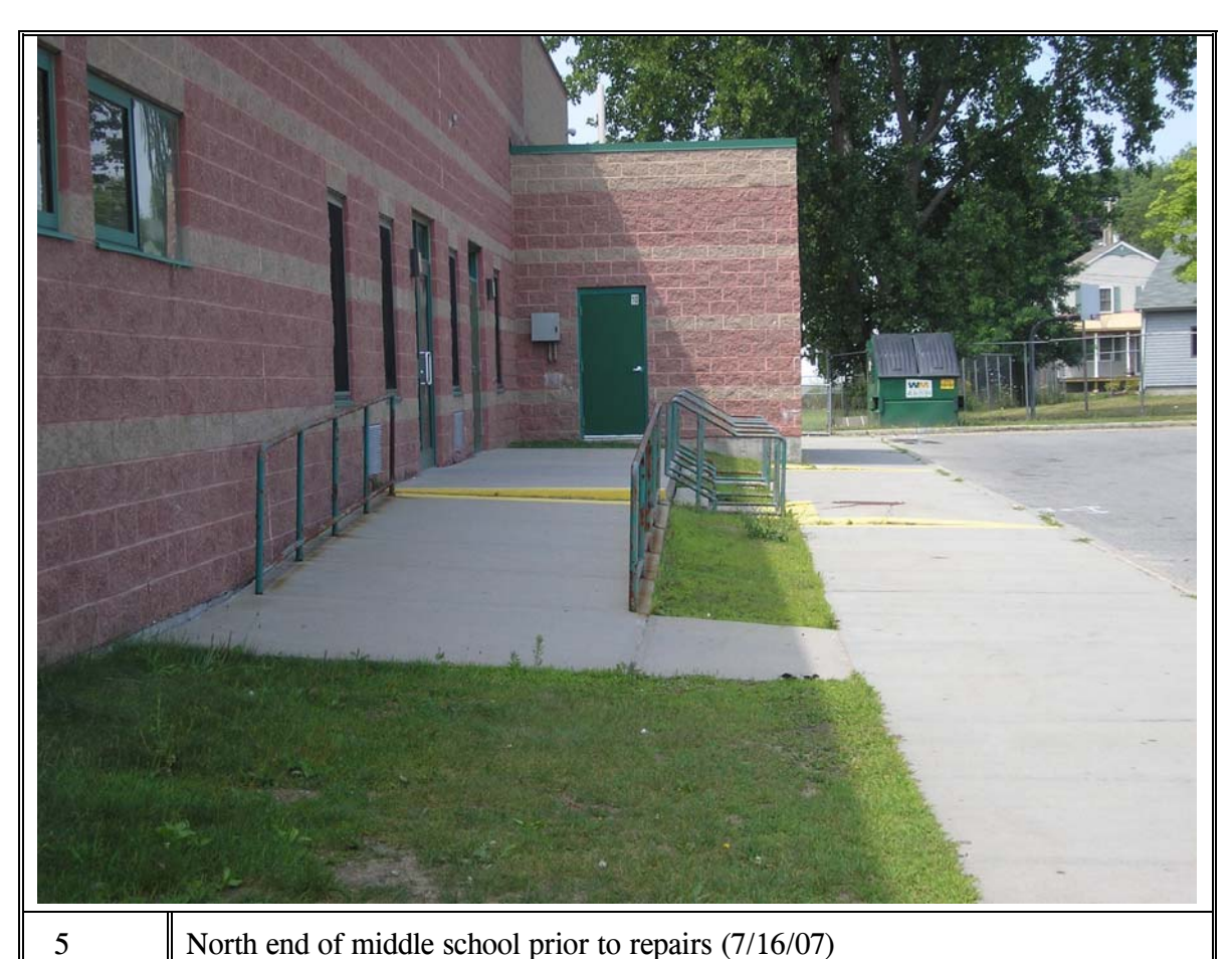
North end of middle school prior to repairs (7/16/07)