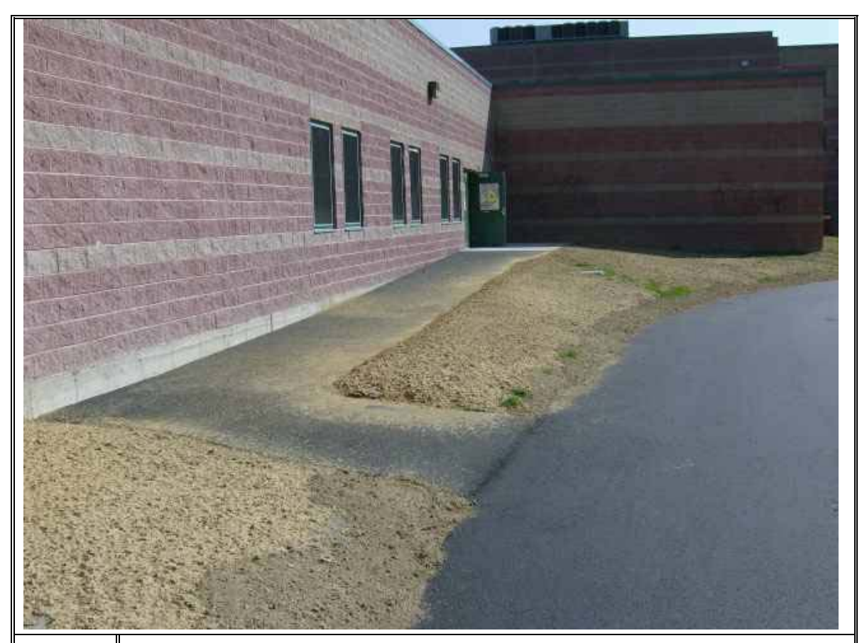
11 Middle school south of gym after repairs completed (9/4/07)