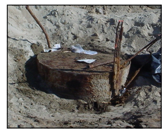
(Above) — One of two Springfield gas machine generators unearthed during the redevelopment of the Ocean House.

(To the right) — Both tanks contained what appeared to be a "wood and burlap lattice" and residual gasoline.