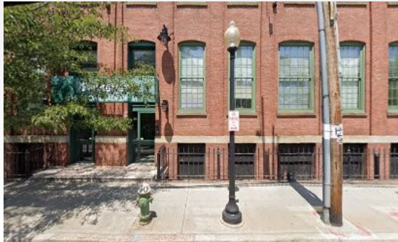
RIDEM's Main Headquarters in Providence