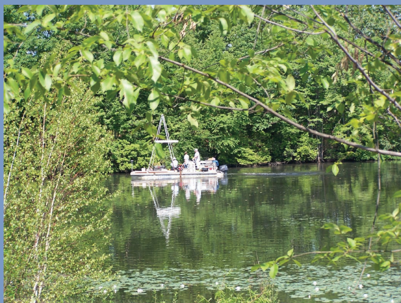
A barge was used to collect sediment samples in the deep water of the Cove.

Textron is analyzing sediment and surface water samples collected from the Cove. Based on results, Textron plans to conduct necessary cleanup activities in the Cove in 2008.