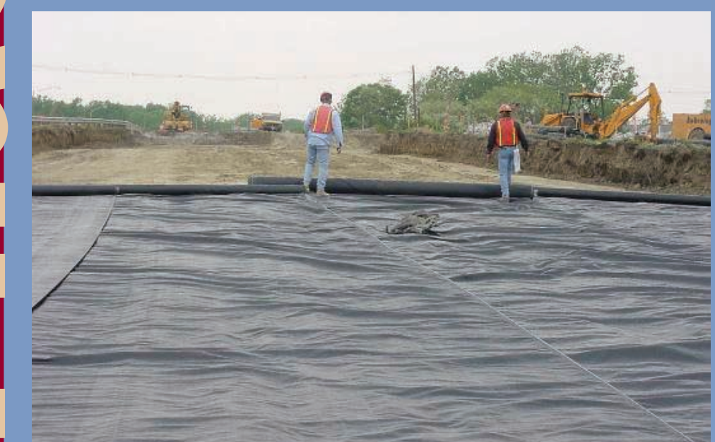
A woven plastic mat called a geo-textile fabric liner will be used (in a similar method as shown here) in the upland area to further isolate contaminated soils. A foot of clean soil and grass seed will cover the geofabric.

With RIDEM approval, Textron intends to use soil capping in Phase III as part of the plan to achieve the recreational use standard in the Park Parcel.