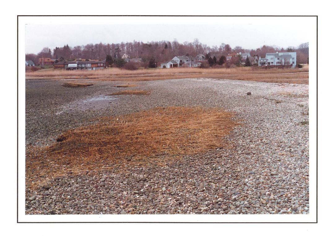
Looking NE across pebble spit towards inlet channel at low tide on 23 March 1999, pond East of Jacks Island (#47).