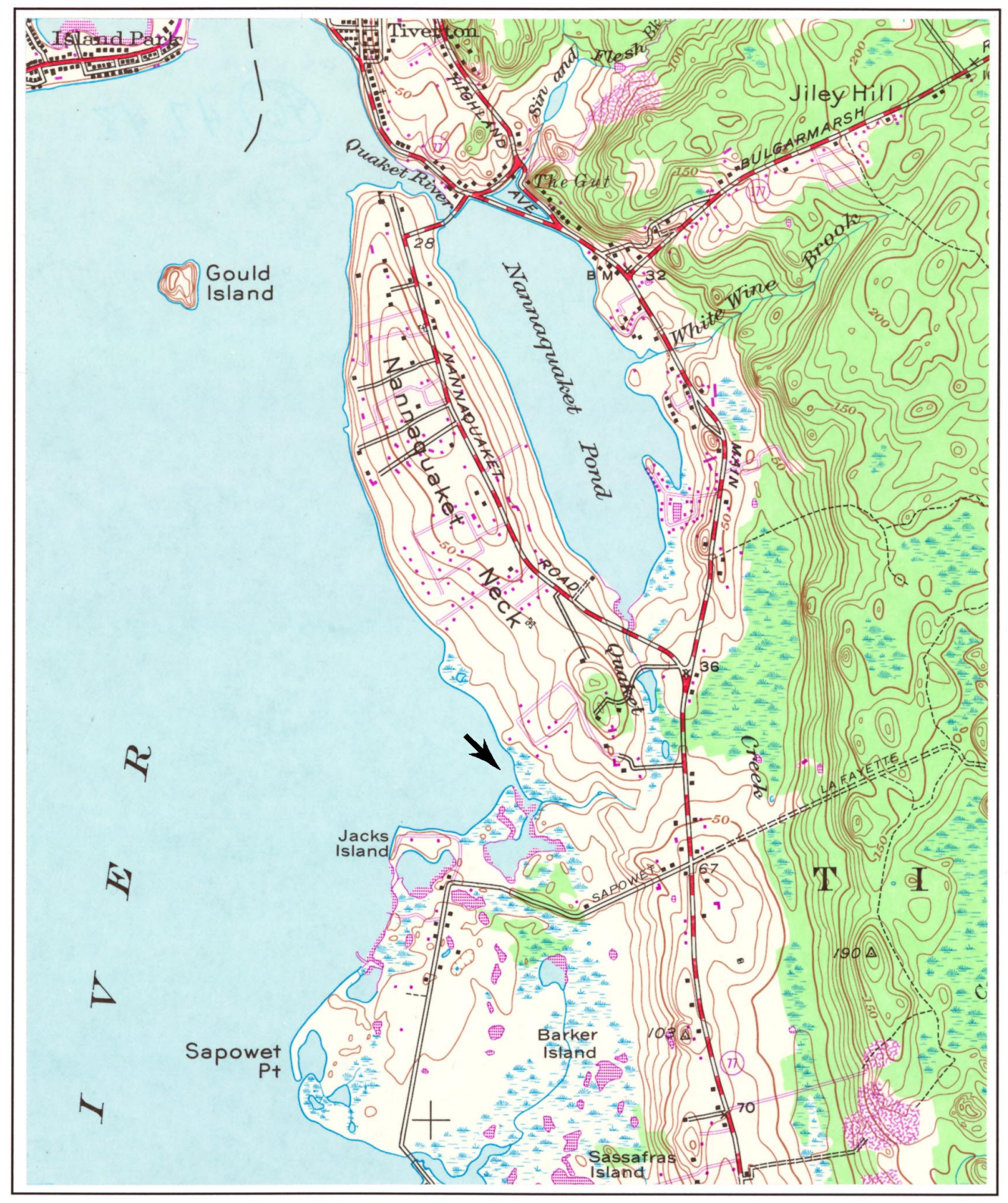
From USGS 7.5' topographic quad: Tiverton, RI-Mass published: 1949, photorevised 1970 and 1975