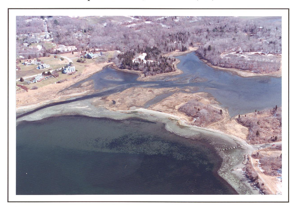
Looking SE at low tide on 17 March 1999, pond East of Jacks Island (#47).