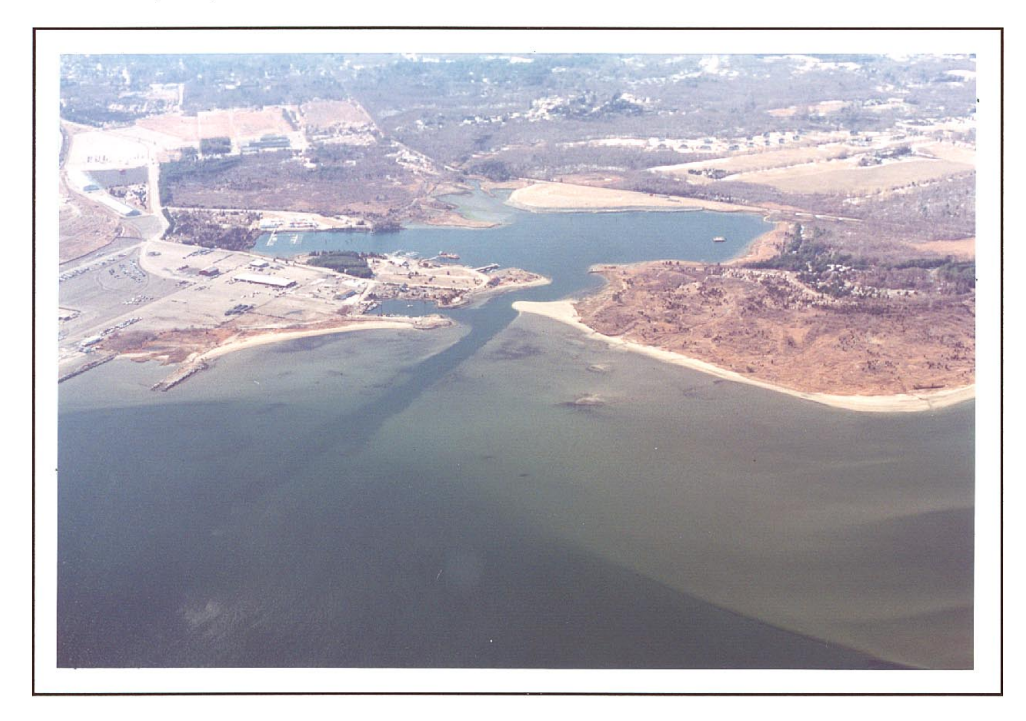
Looking west at low tide on 17 March 1999, Allen Harbor (#24).