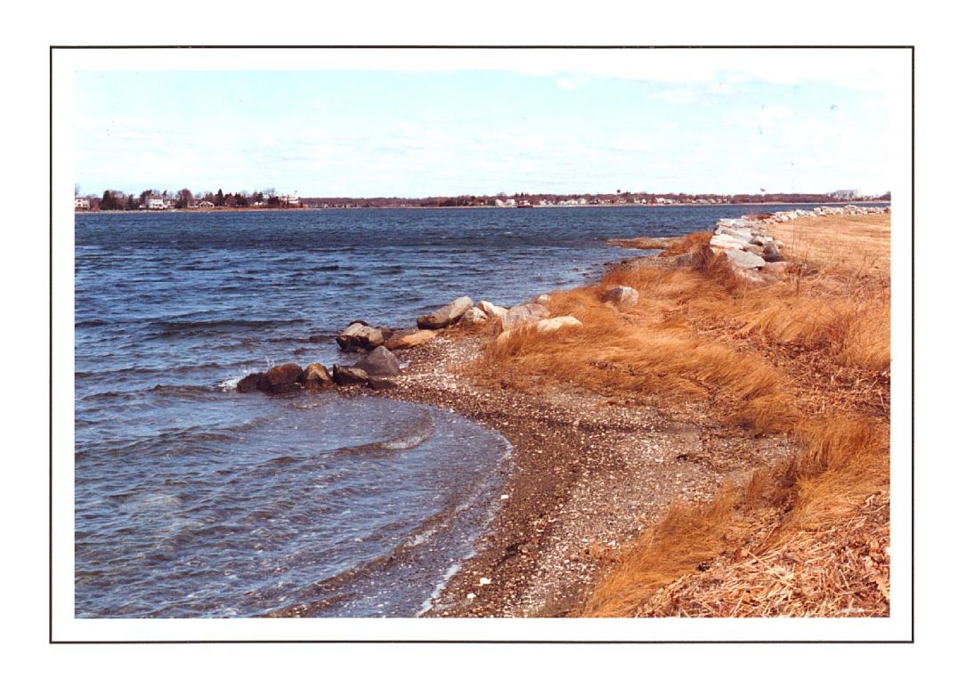
Looking north at CP-1 at high tide on 19 March 1999, Duck Cove (#22).