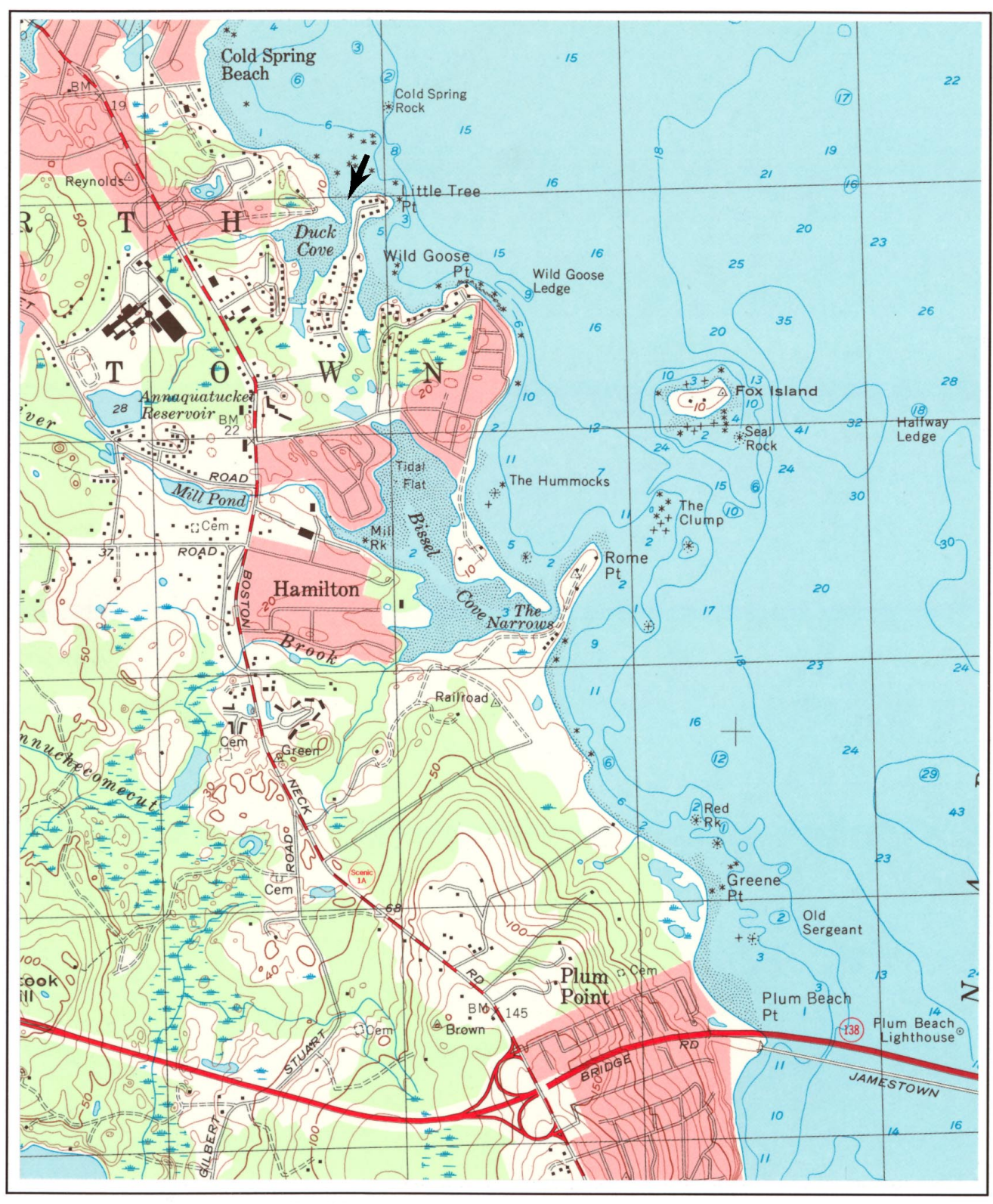
From USGS 7.5' topographic quad: Wickford, Rhode Island, published: 1995