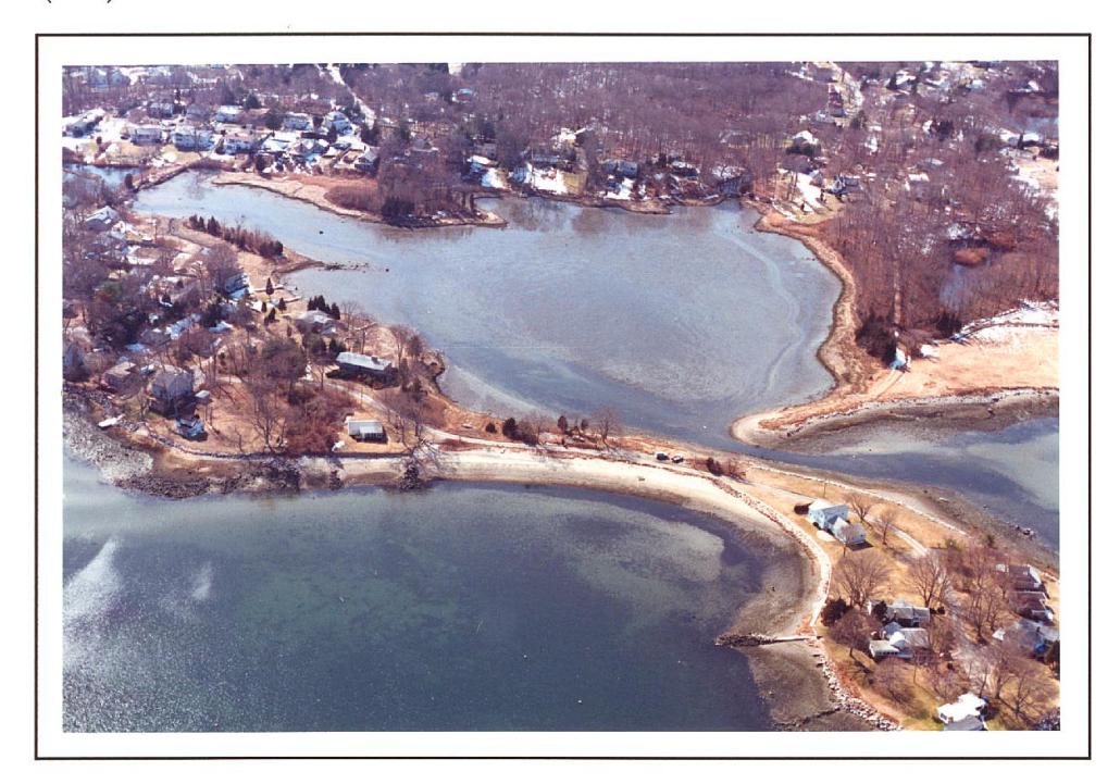
Looking west at low tide on 17 March 1999, Duck Cove (#22).