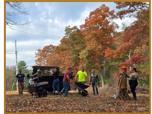
RIDEM team hard at work clearing brush, breaking up old firepits and collecting trash around the Echo Lake Campground site