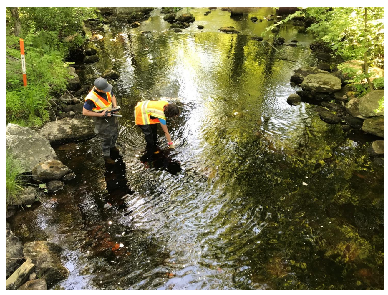
Hemlock Brook - Foster, Rhode Island

Rhode Island Department of Environmental Management Office of Water Resources 235 Promenade Street Providence, RI 02908