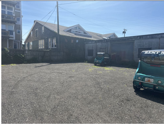
View of temporary cap area.

If you have any questions or concerns, please contact the undersigned at 401-723-9900.