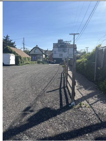
View of temporary cap area.