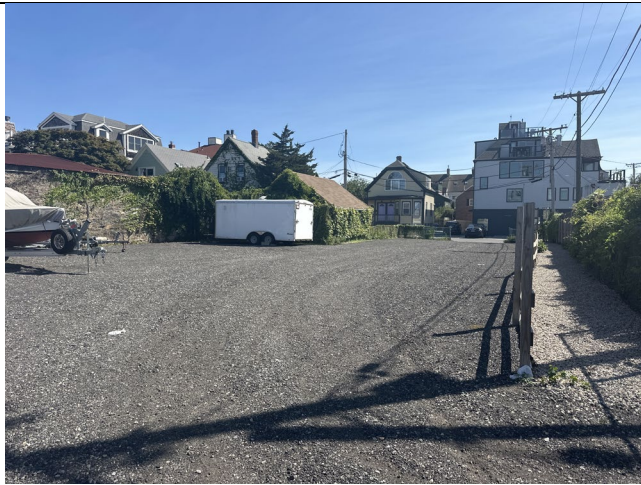
View of temporary cap area.