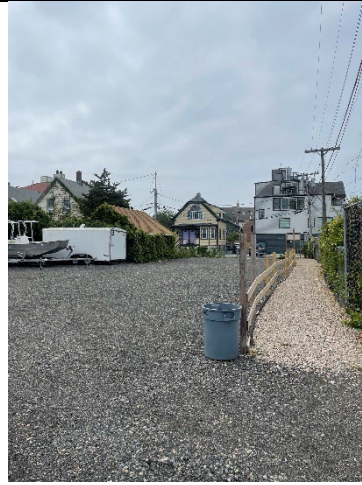
View of temporary cap area.

If you have any questions or concerns, please contact the undersigned at 401-723-9900.