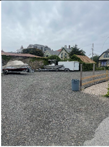
View of temporary cap area.