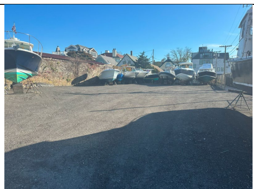
View of temporary cap area.