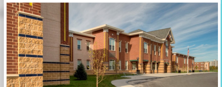
Woonsocket's former Hamlet Mills transformed into a school in 2010