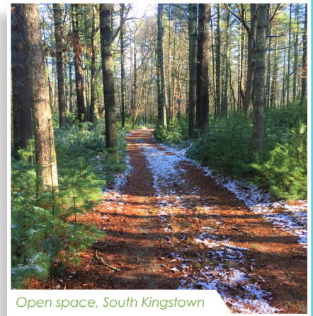
Open space, South Kingstown