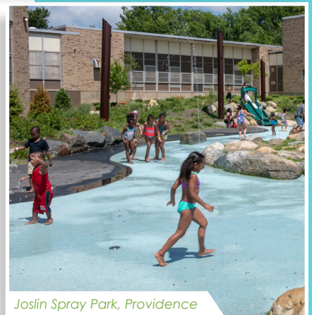
Joslin Spray Park, Providence