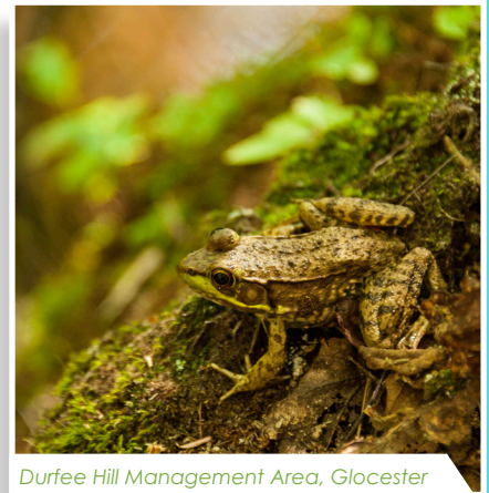
Durfee Hill Management Area, Gloucester

NARRAGANSETT BAY AND WATERSHED RESTORATION $3 MILLION to restore and protect water quality, aquatic habitats and the environmental sustainability of Narragansett Bay and the state's watersheds. Distributed as matching grants, this infusion will advance work toward clean and safe waters for drinking water, shellfishing, recreation and other valued uses. The investment will support jobs and a variety of projects including improved stormwater management, green infrastructure, control of aquatic invasives, in-lake nutrient management actions and riparian buffer and aquatic habitat restoration.