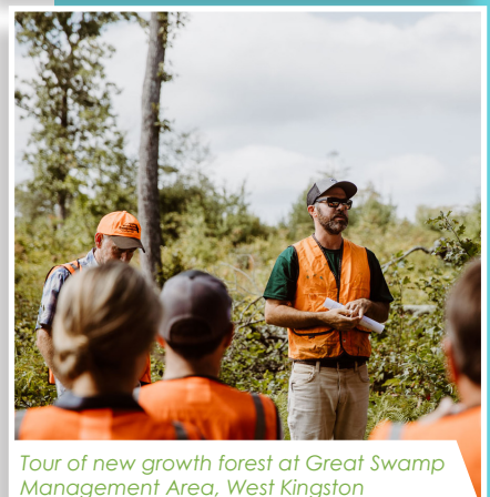
Tour of new growth forest at Great Swamp Management Area, West Kingston