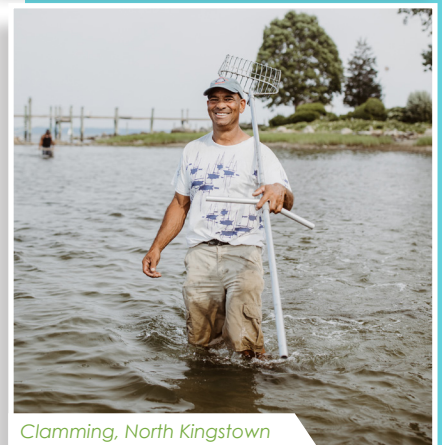
Clamming, North Kingstown