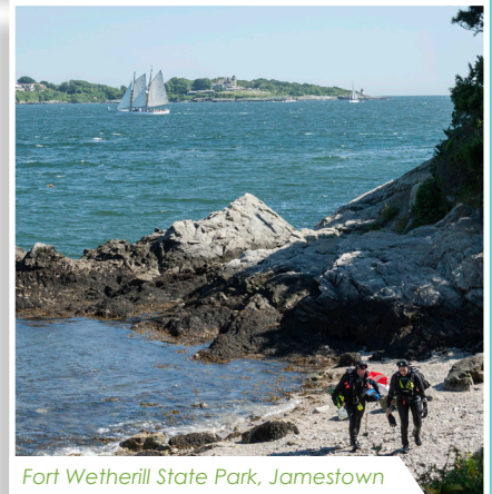
Fort Wetherill State Park, Jamestown