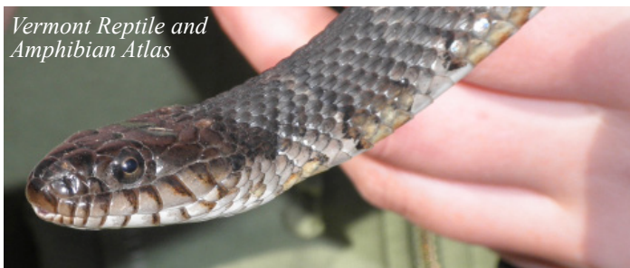
Vertical bars are present along the "lips" of non-venomous water snakes but are lacking in venomous cottonmouths.

It is important to note that vertical pupils in snakes, even venomous snakes, can appear to be round when dilated. These characteristics, along with the "triangle-shaped" head are all imperfect indicators of venomous species.