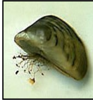
Byssal threads of a zebra mussel †