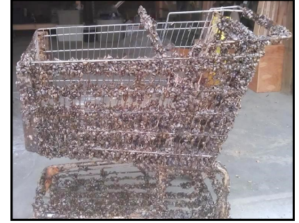
Zebra mussels attach to and cover a shopping cart ††