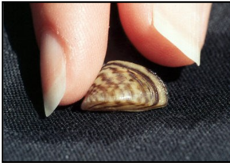
Relative zebra mussel size*