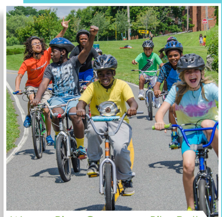
Woony River Greenway Bike Path

The health and vitality of our lands, waters, and communities support our way of life and economy in Rhode Island. This proposed bond invests in our state beaches and parks, outdoor recreation, farmland and forested land, water quality, and community resilience.