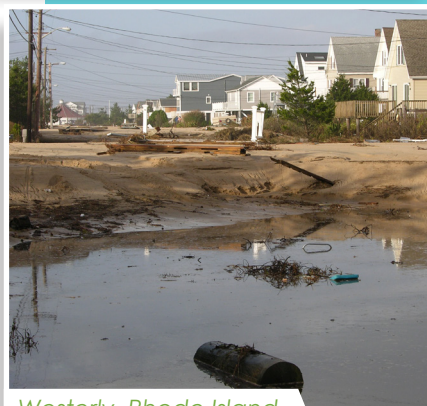
Westerly, Rhode Island after Hurricane Sandy