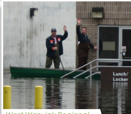
West Warwick Regional Wastewater Treatment Facility during 2010 floods