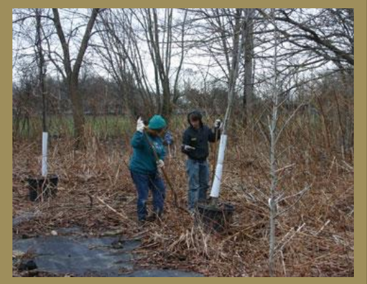
Volunteers checking the status of wetland restoration efforts.

Systematic monitoring of wetland ecosystems is an essential element of the comprehensive water monitoring strategy. These data help to characterize the location, extent and condition of our freshwater wetlands which provide valuable ecosystem services. These data improve the protection and management of these areas by allowing appropriate buffer zones to be implemented and assist in the identification and quantification of major stressors to this resource. These data have been used by the Legislative Task Force examining the adequacy of wetland protection in RI.