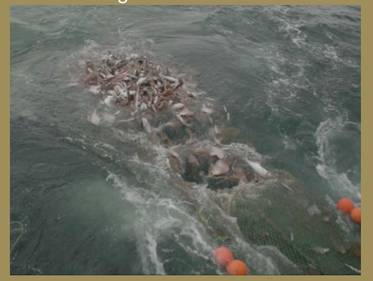
A haul full of cod, skates and dogfish.

Trawl Survey data is vital to assessing the health and status of marine fisheries resources and their habitats in the State of Rhode Island, one of the most significant industries in the Ocean State. These data allow managers to assess the performance and effectiveness of management strategies for economically and ecologically important species, and indicate when different techniques should be implemented. There has been a continued shift from demersal to pelagic species over time, and there is an increased presence of species that are typically found in more southern waters. These shifts are likely do the warming water temperatures associated with climate change.