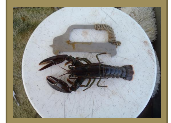
A young lobster that was measured and returned to the ocean to grow to reach adulthood.

RI's commercial lobster fishery is the most valuable fishery in terms of landed value. It is in peril due to declining recruitment in southern New England stocks, meaning inadequate numbers of young lobsters are not surviving to adulthood. Lobster populations are negatively impacted by the increase in other species such as blue crabs, shellfish diseases, and finfish predation by black sea bass (which is a more southern species), and warming temperatures. Trawl survey data is vital to assessing the health and status of marine fisheries resources and their habitats in RI.