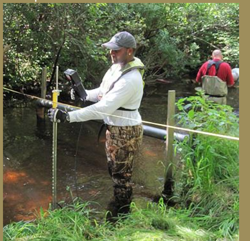
A USGS scientist measures stream flow.

Stream flows have a major impact on water quality, sedimentation rates, and also determine the types of organisms that inhabit an area. They also determine how pollution will interact within the aquatic environment. Reliable stream flow data provides essential information for issuing flood warnings and forecasts, preparing for and managing droughts, managing drinking water supplies, determining irrigation withdrawal limits, supporting hydroelectric power determining timing of production, wastewater discharges and reservoir releases. It also establishes minimum stream flow standards and helps manage floodplains.