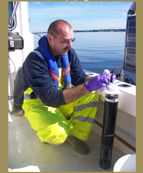
A scientist from NBC adjusting a meter for data collection.

A major focus of the NBFSMN is assessing DO dynamics in the bay. Prior monitoring has documented that conditions vary annually due in part to variable weather conditions. With significant reductions to pollutant loadings achieved through the upgrade of WWTFs, the next several years are an especially important time to monitor the bay. The data will yield information on how the bay is responding ecologically as well as help determine how investments in pollution control, including green infrastructure, are paying off.