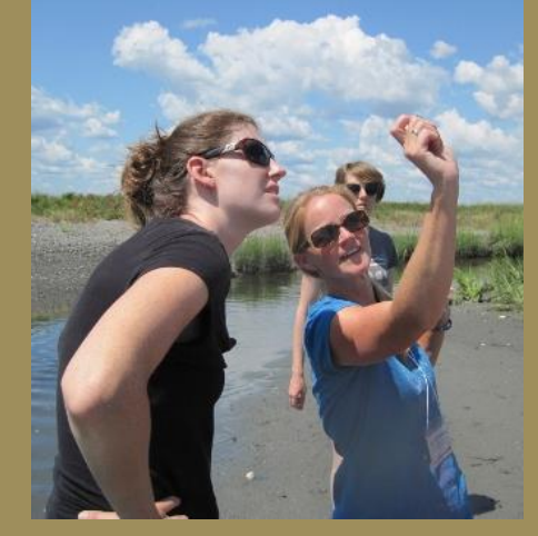
Teachers explore the salt marshes of Prudence Island to learn the impacts of climate change and sea level rise.

Salt marshes are rich in marine life and support many popular fisheries species. They are often the first lines of defense for coastal communities and habitats against sea level rise and tidal inundation. Salt marshes are dominated by vegetation that indicate degradation due to oversaturation and ponding. Soil condition data support the hypothesis that marsh soils are degrading and subsiding in correlation with apparent changes in vegetation dominance.