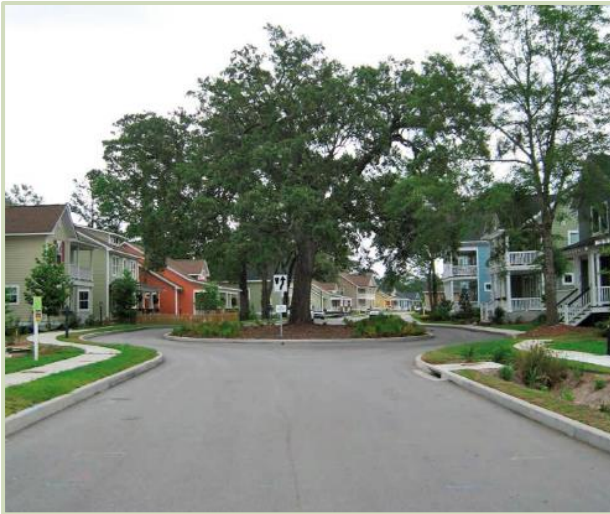
LEFT: Preserving even single mature trees reduces runoff, adds character, and provides cooling shade (CWP).

Avoid impacts by preserving and protecting as much of the natural site condition as possible. Compact development paired with protected open space is one of the most effective strategies.