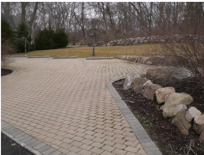
This permeable paver parking lot in Charlestown, RI, reduces runoff and uses the minimum number of parking spots.

Reduce impacts by minimizing the amount of impervious surfaces (such as pavement, rooftop, and compacted soil) which don't allow rainfall to soak into the ground.