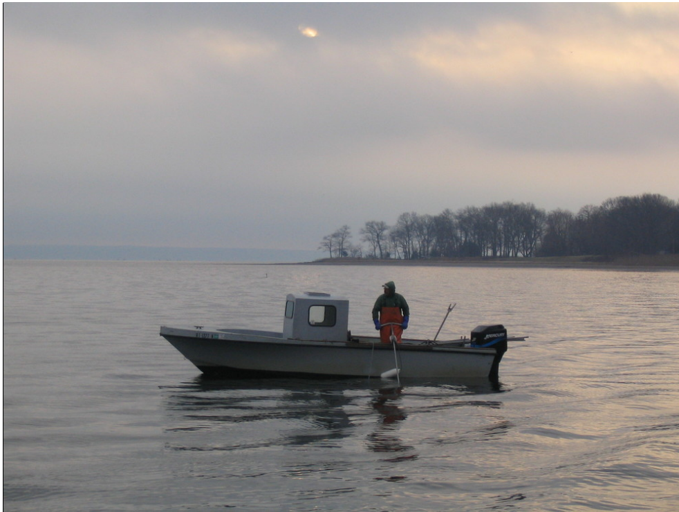
April 2020

RHODE ISLAND DEPARTMENT OF ENVIRONMENTAL MANAGEMENT OFFICE OF WATER RESOURCES