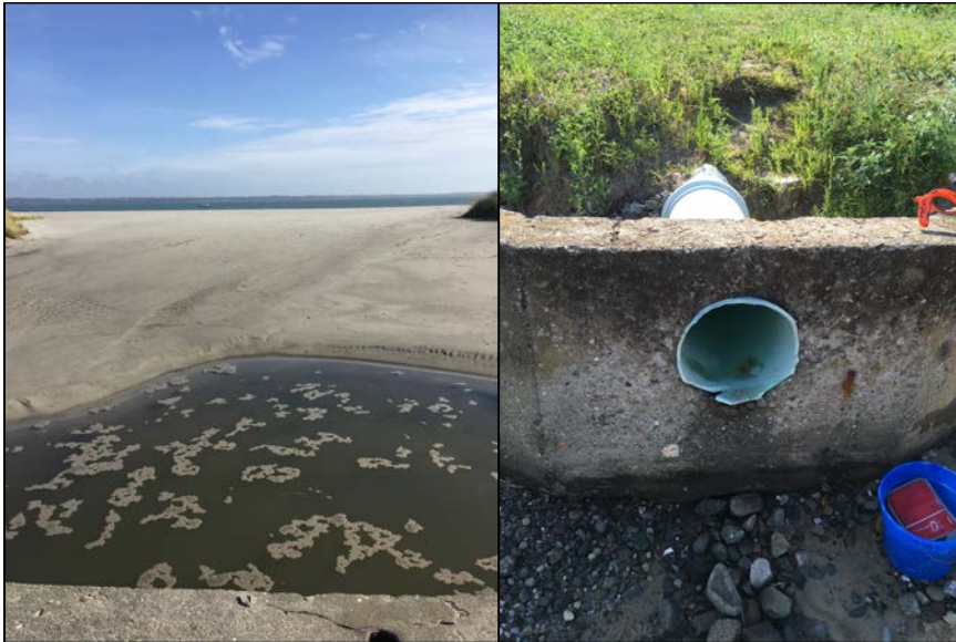
Figure 1: Examples of potential pollution sources.

Photos of two potential pollution sources are shown in Figure 1. Example one (Figure 1, left) is of a drainage basin from an outfall pipe, which is pooling on the beach next to shellfish growing waters and has the potential to drain across the beach with additional runoff during wet weather. The second example (Figure 1, right) is of a drainage pipe with no flow at the time of the survey, however during a rainfall event this source may have flow draining directly into the shellfish growing waters.