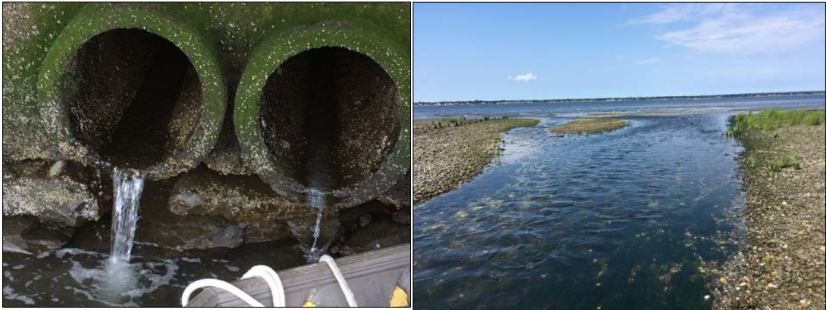
Figure 2: Examples of actual pollution sources.

Two examples of actual pollution sources. The first example (Figure 2, left) are two storm water outfall pipes draining directly into the receiving waters. The second example (Figure 2, right) is from an upland freshwater stream that is draining directly into shellfish growing waters.